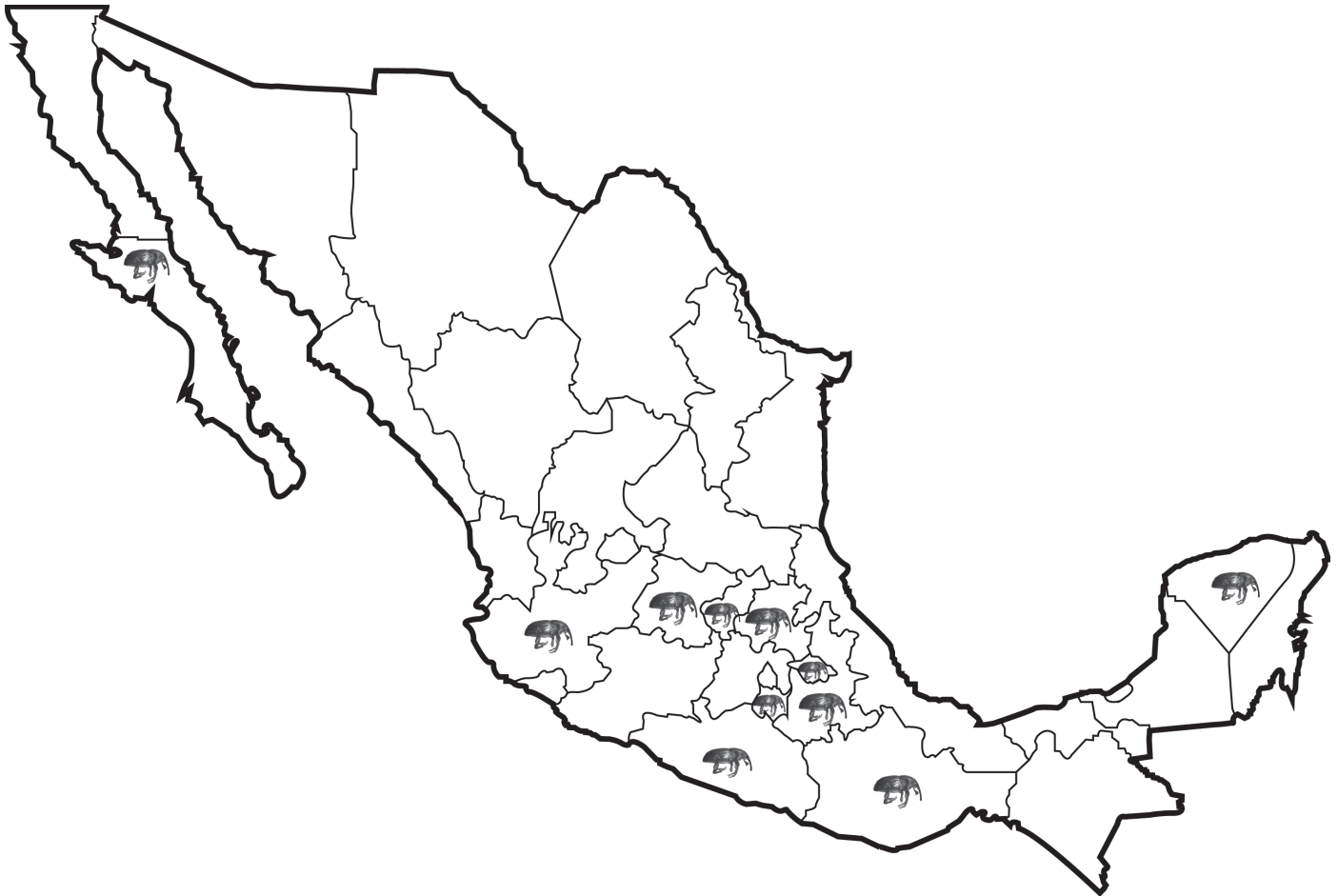
Fig. 1. Distribution of Scyphophorus acupunctatus in Mexico.