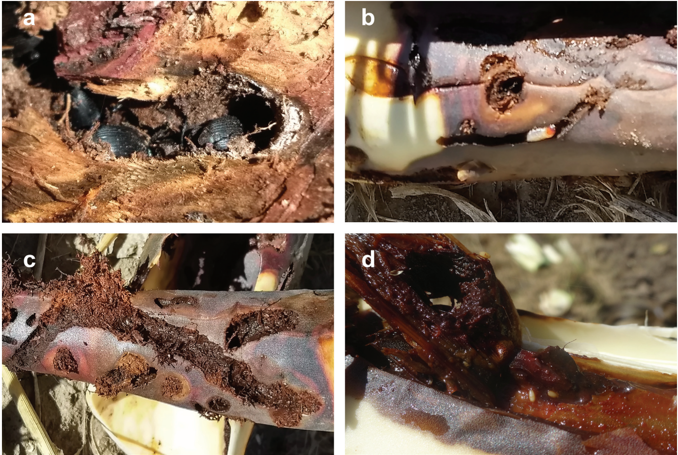
Fig. 2. Infestation of Agave salmiana by Scyphophorus acupunctatus : (a) damage by adults in the beam, (b, c) channels built by larvae, and (d) agave heart rot.

attack during any mo of the yr, although attack is more frequent in the rainy season (Terán-Vargas & Azuara-Domínguez 2013). However, activity varies among different species and geographic location. For example, the highest activity occurs on A. tequilana during the mo of Feb to Jul (Solís-Aguilar et al. 2001). On Agave angustifolia Haw., in the Oaxaca central valleys, maximum activity has been observed in the mo of Jun to Oct, which represents the wettest and warmest period of the year (Aquino-Bolaños et al. 2007). Figueroa-Castro (2009) found the largest populations of agave weevil on A. angustifolia during Apr, May, and Jun in Ahualulco and Amatitán (Oaxaca State).