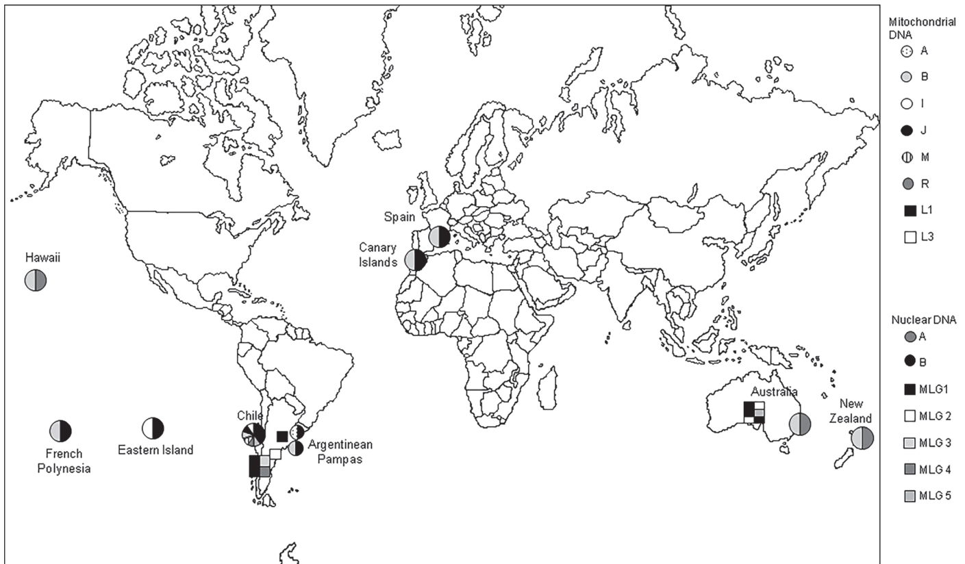
Fig. 1. Worldwide spatial distribution of mitochondrial and nuclear genetic variation of Naupactus cervinus and Naupactus leucoloma . The left and right side of the pie chart depicts the mitochondrial and nuclear variants, respectively. Circles are multi-locus genotypes of Naupactus cervinus and squares are multi-locus genotypes of Naupactus leucoloma . Distribution in Argentina of the colonizer genotypes also is indicated in smaller size.

lations that induced drier conditions in this area led to splitting into 2 lineages, 1 from the northern forests and another from the southern prairies. Diversification in both areas yielded many genotypes in each lineage. One of these genotypes, known as “B-VII” and some of its derivatives, which belong to the lineage of the Argentinean prairies, successfully colonized many continents (B = mitochondrial contribution, and VII = nuclear contribution). Genotype “B-VII,” native from the Argentinean Pampas and spread in marginal areas of western Argentina, also was found in southern Spain, the Canary Islands, Chile, and French Polynesia (Fig. 1), and its derivative “B-V” (1 insertion/deletion event in the internal transcribed spacer 1 sequence with regard to “B-VII”) was found in Australia, Hawaii, and New Zealand (Fig. 1). Genotypes “M-VII,” native from Delta, and the closely related “I-VII” and “J-VII” were found in some locations of Chile, the only place with multiple introductions. Chile aside, genetic diversity estimations in areas of introduction of N. cervinus are zero (Table 1). The nuclear genotype “B-VII” is the most frequent in all novel areas and would be related to adaptive capabilities.