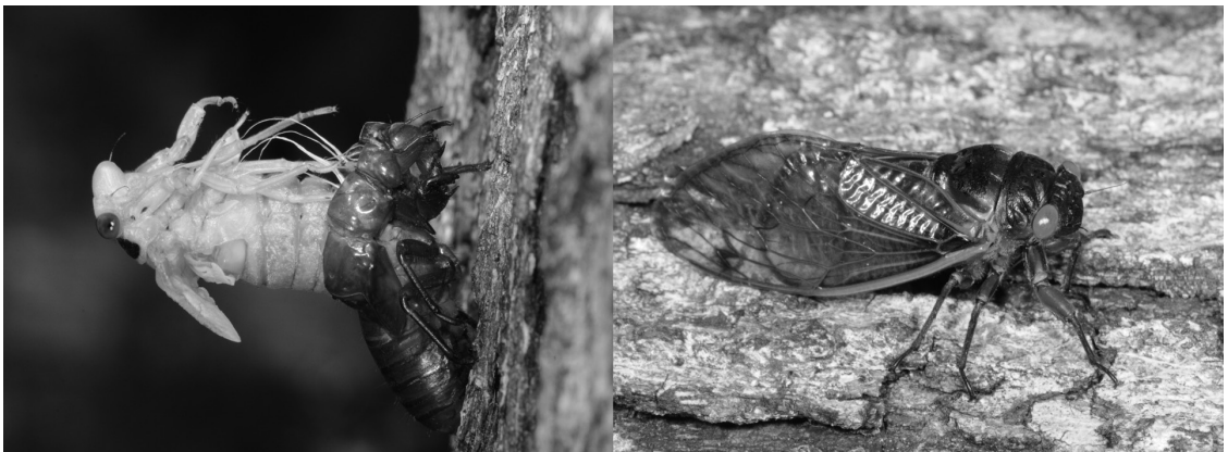
Fig. 1. Periodical cicada nymph from Brood XIX in South Carolina molting into the adult stage.

Three South Carolina state institutions established internet sites for citizens to report sightings (Clemson University: http://clemsoncicada.word