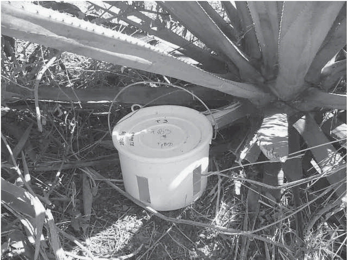
Fig. 1. Trap used to capture Scyphophorus acupunctatus in commercial plantations of Agave tequilana Weber var. 'Azul' in Jalisco, Mexico. The trap was designed by Rangel (2007).

plants) (Table 2). Negative correlations were found between the number of adults on plants and relative humidity ( r = 0.76 , P = 0.002 ) and the total number of weevils (including all developmental stages except eggs) on plants and relative humidity ( r = 0.67 , P = 0.009 ). The number of adults and the total number of weevils (including all developmental stages except eggs) on the plants were not correlated with temperature or precipitation.