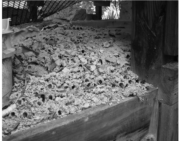
Fig. 1. The original (mother) nest aggregation of Anthophora abrupta discovered in Apr 2010. The bees were nesting in colloidal clay, in an open air shed, in Gainesville, Florida.

Observations of the A. abrupta nest continued in Apr, May, and Jun in 2010. Adults were seen only rarely in mid Jun 2010. After Jun 28, adults were not observed until the following Spring. The observations of the 1st season led to the hypothesis that A. abrupta adults emerging from the existing nest in Spring 2011 would excavate and provision nests in nearby clay if it was provided in portable containers. By using the containers, the nests could be dispersed to seed new areas. With only 1 nesting aggregation of locally rare A. abrupta identified for use, attempts at augmenting the population carried the risk of causing unintended harm to the very population being studied. However, a small split was taken carefully from the original