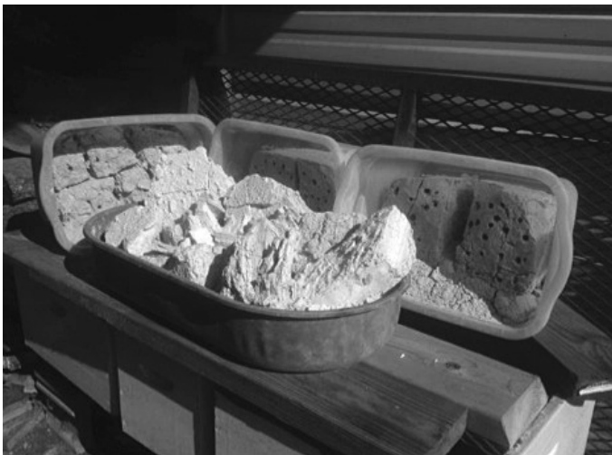
Fig. 3. A 2nd daughter nesting aggregation of Anthophora abrupta established 35.7 km from the original nest site in Gainesville, Florida. It was created as a split from the mother nesting aggregation in Mar 2014.

The activity levels at the mother and both daughter nest aggregations followed similar patterns each year (Fig. 4), although the mother nest aggregation was more active each year than was either daughter nest aggregation. Both the mother and the 1st daughter nest aggregations peaked in activity in late Apr in 2012 and 2013 (Fig. 4). In 2014, the activity at the daughter nest aggregations peaked in early May whereas the activity at the mother nest aggregation peaked in late May (Fig. 4).