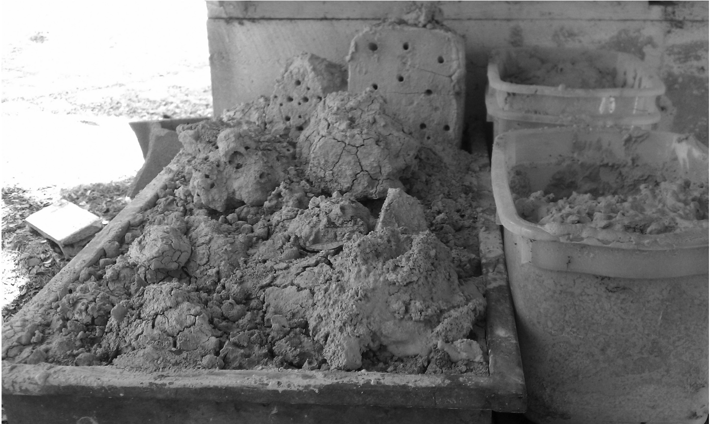
Fig. 2. The 1st daughter nesting aggregation of Anthophora abrupta established 10.3 km from the original nest site in Gainesville, Florida. It was created as a split from the mother nesting aggregation in Mar 2012.

In Apr 2014, the nest aggregations were observed in anticipation of emerging adult A. abrupta . At the mother nest aggregation, on Apr 21, a faint crackling sound in the clay was noted, and adult A. abrupta bees were observed emerging at the mother site on Apr 26, 2014. At the 1st daughter site, the adults were seen emerging on Apr 28, 2014. Adults were not observed emerging at the 2nd daughter site until Apr 30, 2014. Nesting by A. abrupta continued at the mother site and 1st