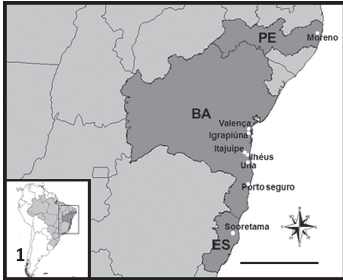
Fig. 1. Map of collection sites. The circles represent the collection points.