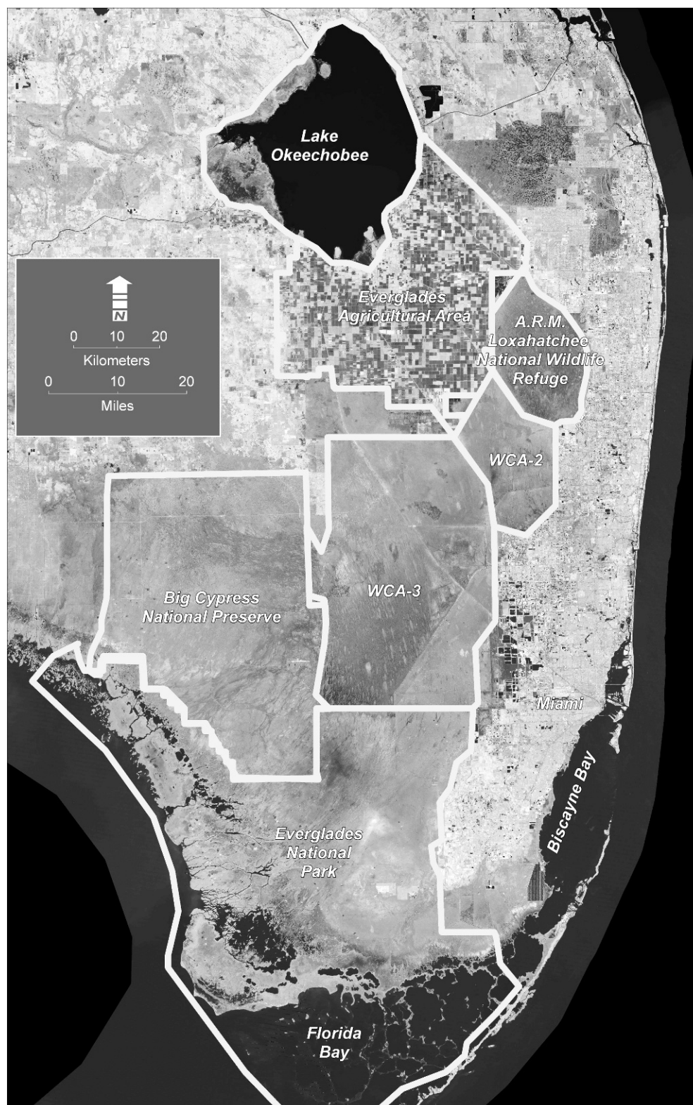
FIG. 1. Physiographic map of southern Florida with conservation land boundaries and place names.