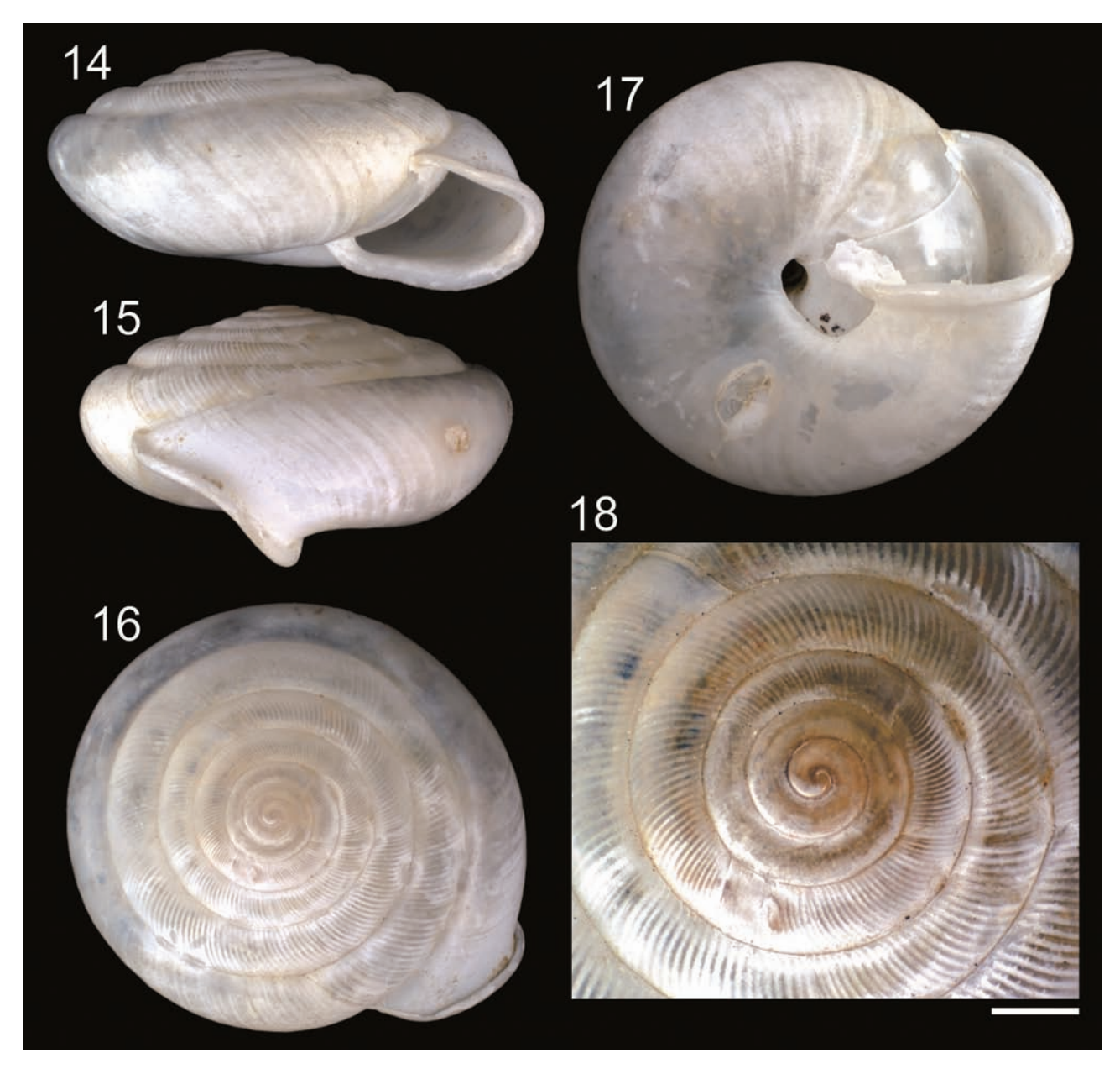
Figs. 14–18. Streptaxis leirae sp. nov. Holotype, MZSP 129247 (H = 6.8 mm, D = 13.5 mm). The scale bar (= 1 mm) refers only to the close-up image of the protoconch and first whorls.

growth). All of the present specimens were collected under bushes in a dune area, indicative of a dry sandy habitat for this species. The present record greatly extends the species' range to the east.