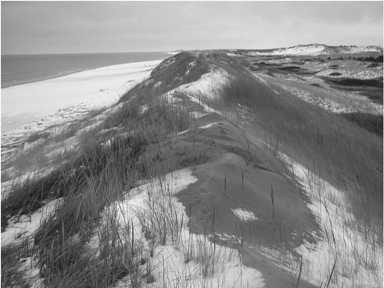
Figure 3. Photograph taken November 30, 2002, of the foredune at Greenwich dunes, Prince Edward Island National Park, showing a scarp on the seaward slope and deposition on the crest and lee slope. The dune is about 12 m high. Sea level is rising here at 3–5 mm/y. For color version of this figure, see page 1193.

nearshore profile, then as water depth increases as a result of sea level rise, these oscillations should result in a gradual landward migration of the bar to keep pace with the location of the equilibrium depth and distance offshore. Similar arguments can be made for all bars present on a profile and indeed for all sediment in the nearshore profile.