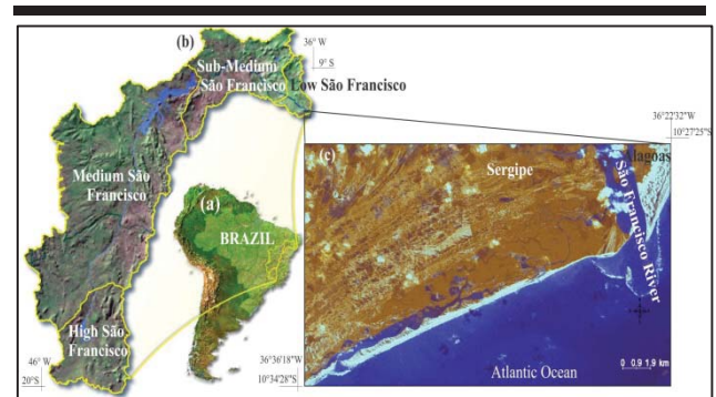
Figure 1. (a) Map of South America and Brazil indicating the location of the São Francisco River basin (adapted from ANA, 2005). (b) The São Francisco River basin with its four divisions (adapted from ANA, 2005). (c) A close-up of the São Francisco River Estuary, the study area.

A total of ten criteria were used in the MCE, including five biotic criteria related to the population parameters of the crab: 1) frequency and 2) density of non-commercial size crabs (NCSC), 3) frequency and 4) density of commercial size crabs (CSC) and 5) mean crab size; three factors related to land use and cover: 6) mangrove vegetation types, 7) distance of mangroves from fishery villages and from 8) shrimp farms, and finally, two social parameters: 9) degrees of mangrove importance for crab conservation and 10) and for crab fishery, both in the view of the local fisherman.