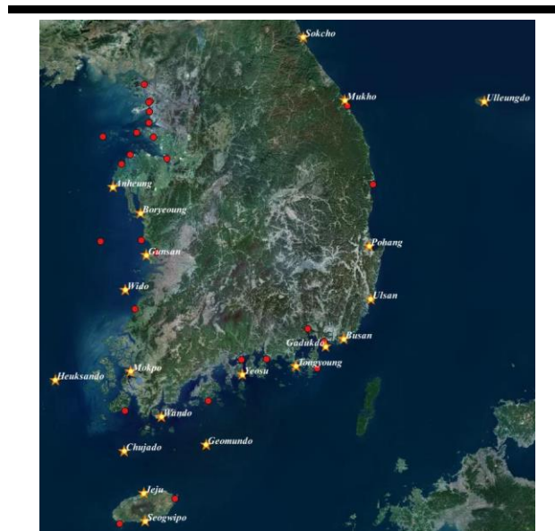
Figure 1. Locations of sea level stations.

structures and has aided disaster mitigation efforts. The sea level data are collected at major harbors and stations located near the islands (Figure 1). Among the many sea level stations of KOON, we used 20 stations that have more than 30 years of data for the frequency analysis.