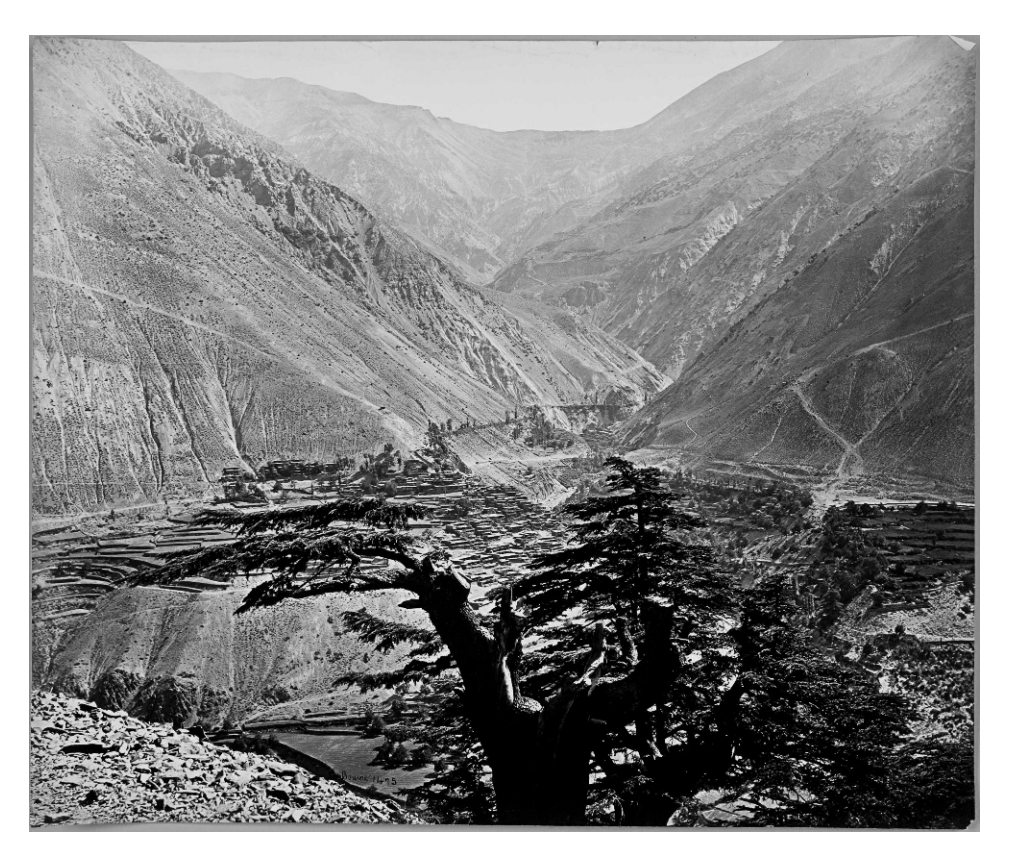
Figure 3. Samuel Bourne, Untitled (Village of Sungnam, Hungrung Pass, Himachal Pradesh, India), Albumen silver print, 1866, Harvard Art Museums/Fogg Museum, Gift of Mrs. R. Minturn Sedgwick in memory of R. Minturn Sedgwick, Class of 1921, P1981.107.

curves and leads into a village precariously situated on the side of the mountain. Framing the image is an ideally placed tree, which upon further examination one can see has been cut to pieces in order to draw attention to the village, and the intersecting lines of the mountain. The important thing to note is the modification of the landscape to better capture in the photograph the situation of the village on the mountainside for compositional purposes, while still leading the viewer to see the scene as 'natural,' untouched, and without modification. The photograph is a constructed image, as is a painting, but photography's indexical quality—that the photograph of the village/mountainside/tree exists because those things were there to be photographed— plays into the idea that visual aesthetics have, and continue, to play a role in how the environment is perceived. This intentional alteration of the landscape to obtain a visual effect exemplifies Bourne's use of the picturesque aesthetic to achieve the desired result.