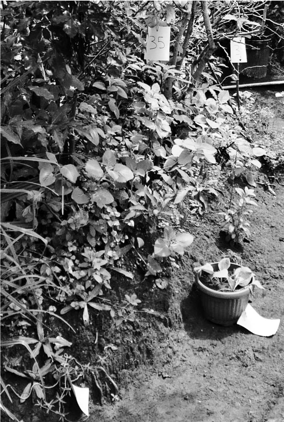
Figure 1. Section of plant trail showing four numbered plants, 34–37 (downhill from top-right to bottom-left, 34 koupiyé [ Portulaca oleracea ]; 35, godité [ Plectranthus amboinicus ]; 36, plantain [ Plantago major ], in pot because Mrs. Coipel weeded just before we set up the trail; and 37, chadon beni [ Eryngium foetidum ]).