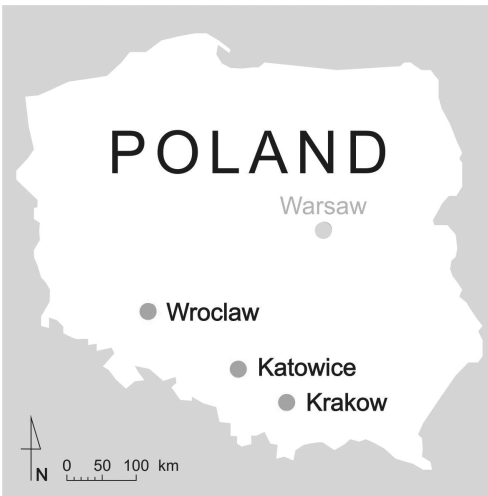
Figure 1. Map of the study sites.

users. According to this Act, family allotment gardens are portions of land that are in the hands of associations of allotment