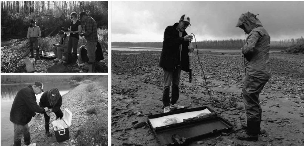
Figure 4. Clam Team Members working together in the field.

15 minutes) of the area to find live freshwater mussels or shells. If these items are observed, we utilize a timed search survey method: a qualitative approach to help delineate abundance and population density (Metcalf-Smith et al. 2000; Reid 2016). Our sampling method typically involves two to four members of the Clam Team who visually inspect the shoreline and two to four members in the water using clear bottom viewers or tactile searches (i.e., sifting about 2–30 cm into the river substrate). There was no fixed pattern to our searching and not all of the habitat was covered (Reid 2016). Depending on the size of the site, the search typically takes up to two hours. Site sizes vary from a 10 to 50 m stretch, with a wadable width of 2 to 10 m. If live freshwater mussels or their shells are found at a site, they are identified to the species level.