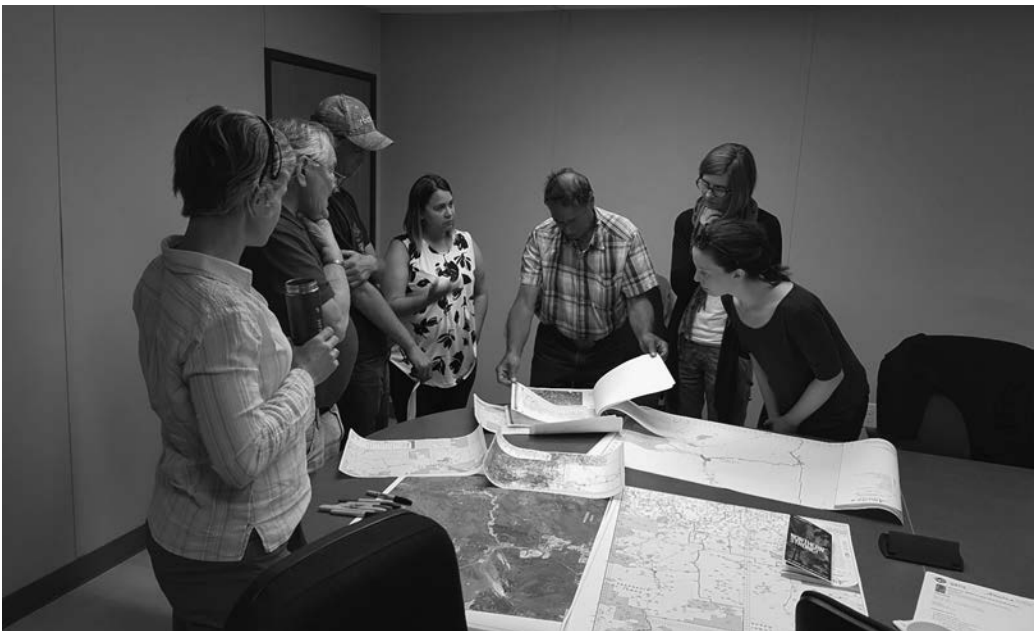
Figure 3. Community mapping with the Clam Team.

and Western science; (3) exchange ideas; and (4) discuss how we wanted to move forward together to answer our research questions. In the meeting, McMurray Métis Elders and land users outlined that Indigenous Knowledge included ceremonial protocols (e.g., prayer, tobacco, and smudging), and shared McMurray Métis history, culture, and context in which we would undertake this research. McMurray Métis Elders and land users also articulated Indigenous methods, oral history, and current knowledge of freshwater mussels. As part of our discussion, we undertook a community mapping exercise to share understanding of past and present freshwater mussel site locations from both an Indigenous Knowledge and Western science perspective (Figure 3). The Western science component included sharing the paucity of information about freshwater mussels in the LAR, while drawing from relevant scientific information sourced from areas outside of Alberta. Application of Western science methods to understand contaminant loading in various environmental media pertinent to this research were explored together.