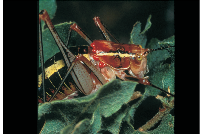
Fig. 2. Poecilimon laevissimus bearing engorged eutrombiid mites. Erimanthos valley, Peloponnese, Greece, 1997. See Plate III.