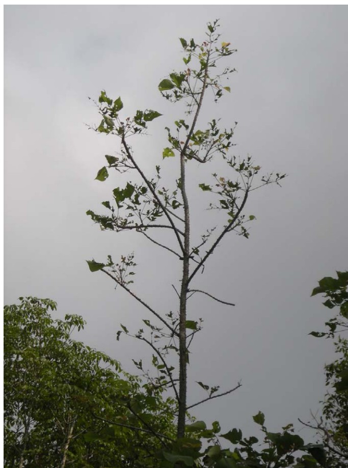
Fig. 2. Erythrina indica tree (~ 8 m tall) showing A. miliaris feeding damage. In south India this tree is pruned to 3-4 m and then used to support and shade black pepper vines. Although the grasshoppers will feed readily on E. indica , they generally do not feed on the black pepper vines.

In this context, the recent occurrence of A. miliaris in high altitudes of the Idukki district, Kerala, south India presents a dilemma as to whether a conservation or suppression strategy should be employed for this species. A. miliaris was reported from different upland forest areas in this district in 1983, 1994, 2003, 2005 and 2008 in rela-