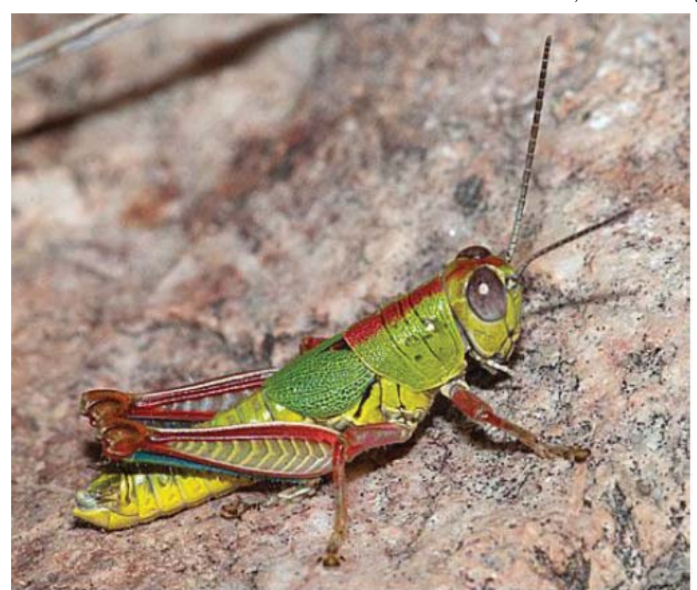
Fig 2. Adult Aztecacris gloriosus . Male. Warsaw Canyon, Pajarito Mountains, Santa Cruz County, Arizona. 2 OCT 2011. For color version, see Plate XI.

On 13 October, after checking many clumps of Gutierrezia sarothrae and just before exiting the west end of FR 4186, we stopped at