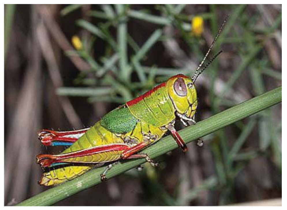
Fig 3. Adult Aztecacris gloriosus . Female. Warsaw Canyon, Pajarito Mountains, Santa Cruz County, Arizona. 2 OCT 2011. For color version, see Plate XI.

a lone roadside Turpentine Bush ( Ericameria laricifolia ) (Asteraceae). The site (lat. 31.46277° N, long. 111.19437° W) is at an elevation of 1,323 m. It is an open slope with Emory Oak and Pointleaf Manzanita ( Arctostaphylos pungens ). One male A. gloriosus was clinging to a vertical stem inside the shrub. Other grasshoppers present on the same plant were Melanoplus aridus/desultorius , M. differentialis nigricans , M. gladstoni , and M. lakinus .