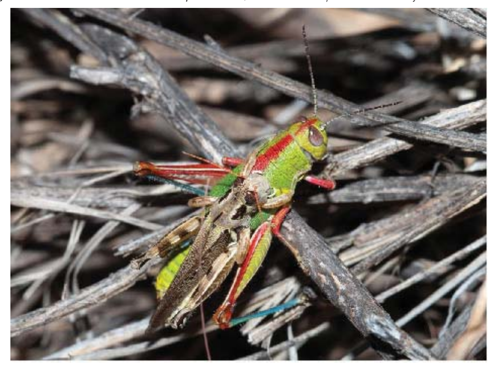
JOURNAL OF ORTHOPTERA RESEARCH 2012, 21(2)

Orthopterans at the Japanese Tank site were conspicuous on 2 and 5 October 2011 and included: Taeniopoda eques, Schistocerca nitens, Arphia pseudonietana, Lactista azteca, Leprus wheeleri, Trachyrhachys kiowa, Trimerotropis pallidipennis, Acantherus piperatus, Ageneotettix deorum, Amphitornus coloradus, Boopedon flaviventris, B. nubilum, Hesperotettix viridis, Mermeria bivittata, Opeia sp., Paropomala pallida, Rhammatocerus viatorius, Syrbula montezuma, Barytettix humphreysi, Melanoplus lakinus, and M. aridus/desultorius. Many of these are