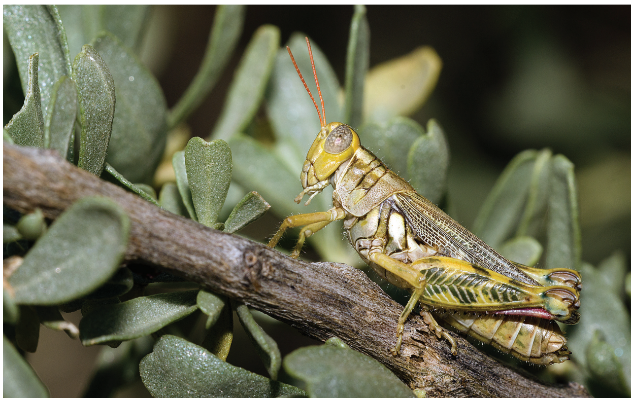
Fig. 1. Adult female Aeoloplides tenuipennis on fourwing saltbush, San Pedro Riparian National Conservation Area. Photographed 8 September 2015.

basin surrounded by farmland and Chihuahuan Desert scrub/Desert grassland, receives ca 330 mm (13 in.) of rainfall/year (WeatherDB 2015) and collects runoff and sediments from surrounding North-South oriented mountain ranges. Alluvial soils adjacent to managed wetlands support extensive stands of fourwing saltbush. Other shrubs at the collecting site were a few small mesquites. Ground cover included plains bristlegrass, Setaria macrostachya (Poaceae), peppergrass, prickly Russian thistle, Coulter's horseweed, golden crownbeard, hairyseed bahia, Bahia absinthifolia (Asteraceae), burroweed, Isocoma tenuisecta (Asteraceae), silverleaf nightshade, copper globemallow, and trailing windmills. Specimens were collected by shaking foliage over the mouth of an insect net. The area sampled was ca 20 × 30 m and included both individual plants and clumps of fourwing saltbush. All visits to Whitewater Draw were made during mid-morning to mid-day and temperatures were ca 32°C (90°F).