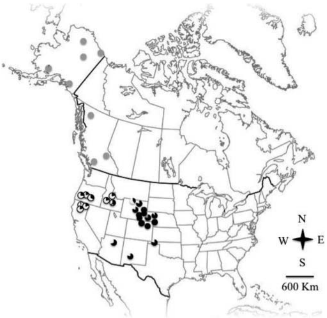
Figure 2. Spatially explicit population structure of our sample of 32 Golden Eagles. The colors in the pie charts reflects the relative posterior probability of membership of the individual's genome belonging to each of the three genetic groups identified by STRUCTURE with the Alaska-British Columbia, California-Oregon-Idaho, and Arizona-Colorado-Nebraska-New Mexico-Oklahoma-Wyoming groups represented by gray, white, and black, respectively.