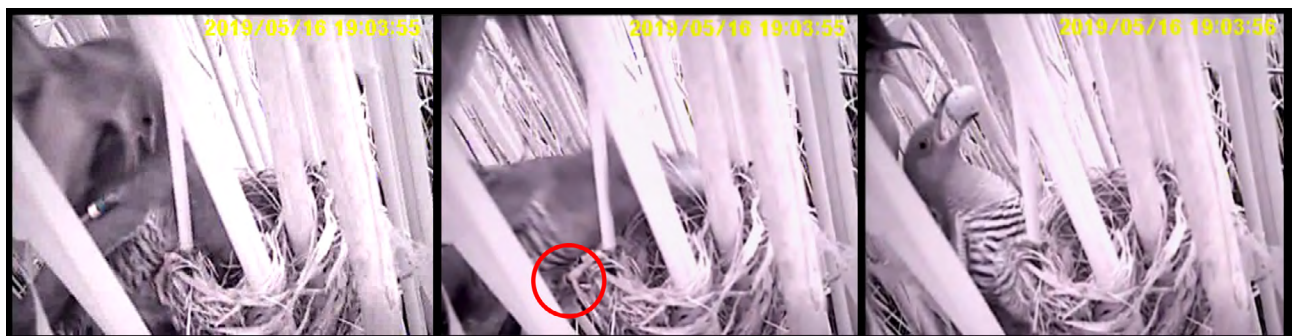
Fig. 2. Screenshots from the video-recording in which a female common cuckoo was knocked down from the nest by the great reed warbler female. The nest contained three host eggs and the cuckoo removed one of them during the attacks by the host female. The female cuckoo did not lay her own egg. The second frame shows that the cuckoo had a ring on her right tarsus (in the red circle). For the whole video, see supplementary online material.