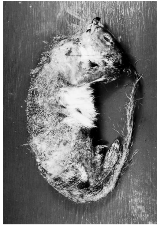
FIGURE 1. Representative case of notoedric mange in a western gray squirrel, with patchy alopecia of the ears, head, trunk, and tail.

Two squirrels (one male, one female) with typical lesions suggestive of notoedric mange were submitted to the Southeastern Cooperative Wildlife Disease Study (College of Veterinary Medicine, The University of Georgia, Athens, Georgia, USA) for examination. Both squirrels had been found dead at the bases of trees during the trapping sessions, and both squirrels had been captured and ear tagged before death. Both animals were mature adults, and each was nearly emaciated with patchy to extensive alopecia affecting the ears, head, dorsal trunk, and tail (Fig. 1). Alopecic areas of skin were thickened, corrugated, and often were covered by adherent tan crusts. In one squirrel, the ears adjacent to the ear tags were most severely affected, whereas the distribution of lesions was more widespread in the second squirrel. Representative samples of skin were fixed in 10% neutral buffered formalin, embedded in paraffin, sectioned at 3–4 \mu\text{m} , stained with hematoxylin and eosin, and examined by light microscopy. Mi-