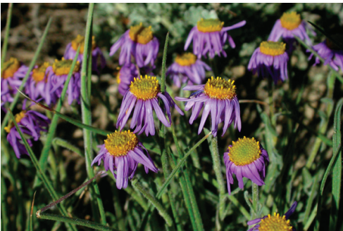
FIG. 3. Erigeron clokeyi (sect. Stenactis ). Ray corollas are reflexing, heads nodding in bud.

Taprooted, perennial; caudex branching, retaining old leaf bases; glabrous; stems branched; leaves filiform or linear to linear-oblongate, not clasping; heads erect in bud; rays white, often with an abaxial midstripe, not coiling or reflexing; achenes 1.5–2.2 mm long, 2-nerved; pappus of 10–16 bristles.