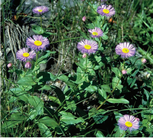
FIG. 2. Erigeron speciosus (sect. Fruticosus ).

1. Sect. Arenarioides (Rydb.) Nesom, Phytologia 67: 70. 1989. Erigeron [unranked sp. group] Arenarioides Rydb., Fl. Rocky Mts. 897. 1918, in clave. TYPE: Erigeron arenarioides (D.C. Eaton ex A. Gray) A. Gray ex Rydb.