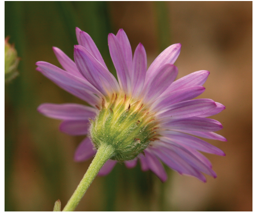
FIG. 7. Erigeron filifolius (sect. Filifolii ). Close-up of head.

Perennial, taprooted; caudex simple or more commonly a multicapital crown or with elongating branches, forming mats ( E. acomanus , E. tener ) connected by systems of lignescent rhizomes and caudex branches; vestiture short-strigillose to villous, hirsute, or glabrous, hairs white ( E. tener , E. acomanus , E. tweedyi , and E. wilkenii have similar vestiture; E. cronquistii , E. evermannii , E. subglaber glabrous to glabrate); stems branching (simple in E. acomanus , E. wilkenii ); leaves spatulate to oblanceolate, entire, with expanded and indurate petiole bases, often folding, not clasping; heads 1 or 1–3, nodding in bud ( E. acomanus , E. tweedyi ), behavior unknown in others; phyllaries with a broad green midband, minutely glandular; rays white to pink, not coiling (or coiling in