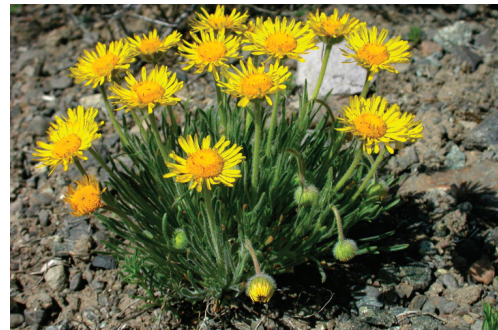
FIG. 5. Erigeron chrysopsidis (sect. Disparipili ). Heads are nodding in bud. Yellow-rayed species have evolved among white- and blue-rayed ones in sects. Disparipili , Erigeron , and Osteocaulis .

Erigeron salmonensis was recently described (Brunsfield and Nesom, 1989); the two species of sect. Arenarioides were regarded as closely related but isolated within the genus. Molecular data (Noyes, 2000a) indicate that E. tweedyi Canby (sect. Spathifolium ) is closely related to E. arenarioides – with this molecular pointer, morphological similarities between sect. Spathifolium and sect. Arenarioides are apparent, but sect. Spathifolium , as represented by E. tener , is placed by the molecular data most closely related to sect. Osteocaulis .