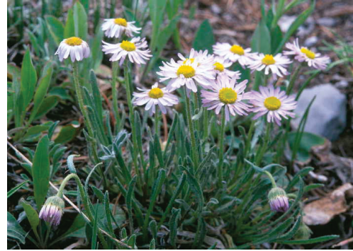
FIG. 4. Erigeron vetensis (sect. Stenactis). Ray corollas are reflexing, heads nodding in bud.