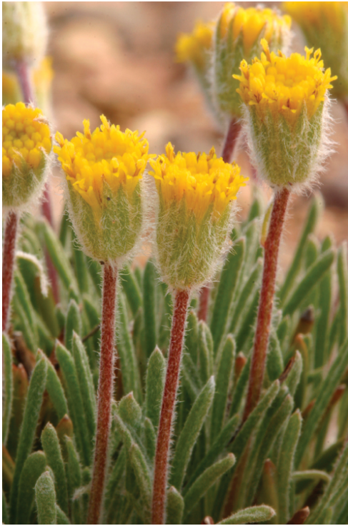
FIG. 6. Erigeron bloomeri (sect. Osteocaulis ). Ray florets are completely absent.

2. Sect Asterigeron Rydb., Fl. Rocky Mts. 891. 1918. TYPE: Erigeron watsonii Erigeron sect. Spathifolium Nesom, Phytologia 67: 84. 1989. TYPE: Erigeron tener (A. Gray) A. Gray