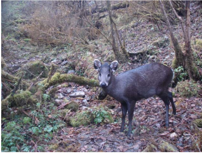
Fig. 5. —Typical forested habitats of Elaphodus cephalophus in southern China tend to have open understories but often with abundant shrubs (not obvious here) and herbaceous vegetation for cover and food. Photograph taken during the camera-trap surveys of Li et al. (2012) in Sichuan, Gansu, and Shaanxi provinces, China, and freely available at Smithsonian Wild ( www.siwild.si.edu ).

Shaanxi (Zeng et al. 2007), and Tangjiahe Reserve, Sichuan, where they were found significantly disjunct from human settlements (Wang et al. 2006).