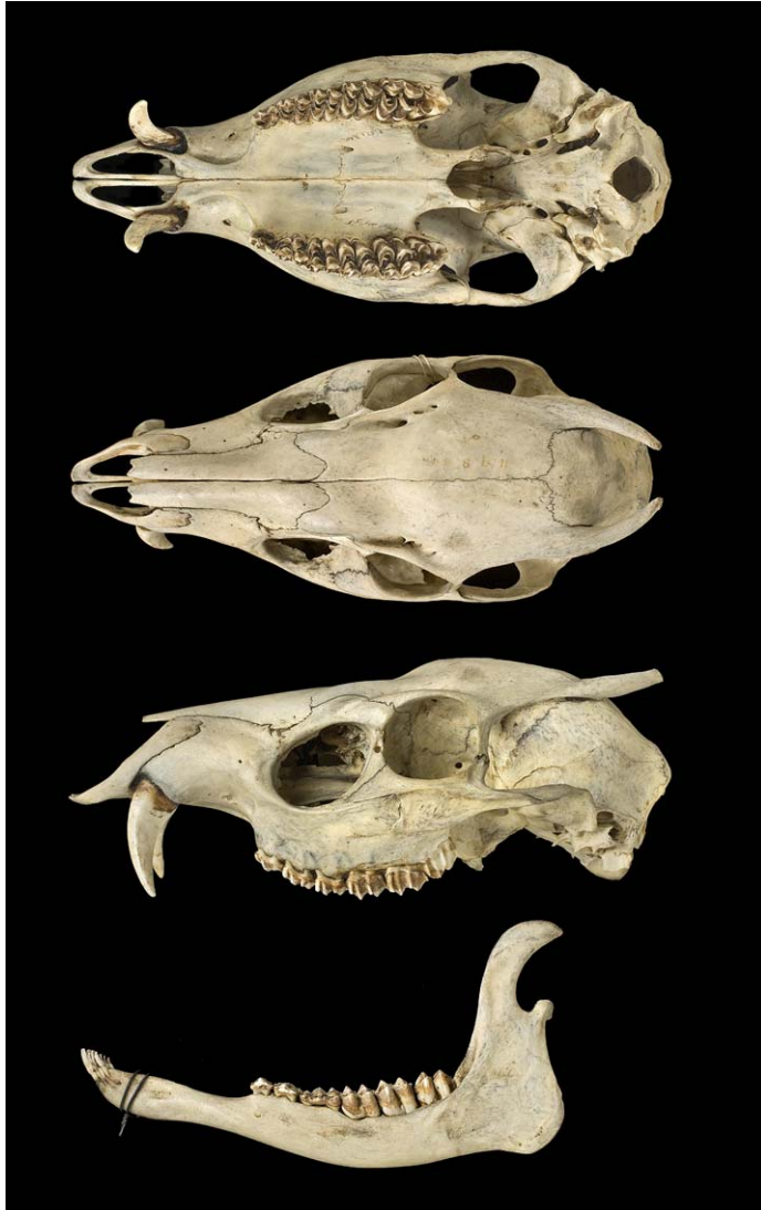
Fig. 3. —Ventral, dorsal, and lateral views of skull and lateral view of mandible of an adult male Elaphodus cephalophus (The Natural History Museum, London, specimen 11.9.8.44); upper canines, particularly large preorbital openings, and reduced and convergent antler pedicels (on males only) are characteristic. Greatest length of skull is 196.0 mm.