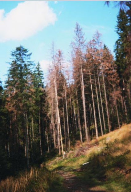
FIGURE 1 The beginning of the collective spruce decline in 1988, Nálepko district, Western Carpathians, Slovak Republic.

have an interest. The total forest acreage in Slovakia has increased by more than 10% during the last 40 years, and total growing stock represents 190 m 3 per hectare. But the condition of forests in the last decades has markedly deteriorated (Figures 1 and 2). Slovakia is currently exploring ways and means of restoring its forests to a healthy condition.