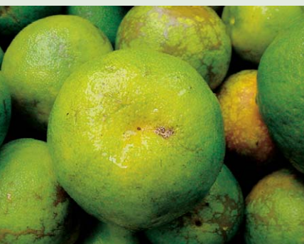
FIGURE 3 Coorg orange is known for its sweet taste, its greenish color, and its tight skin.

“We are not the owners of the GI, we are the guardians. We will hand over the ownership to the producers.” (Department of Horticulture)