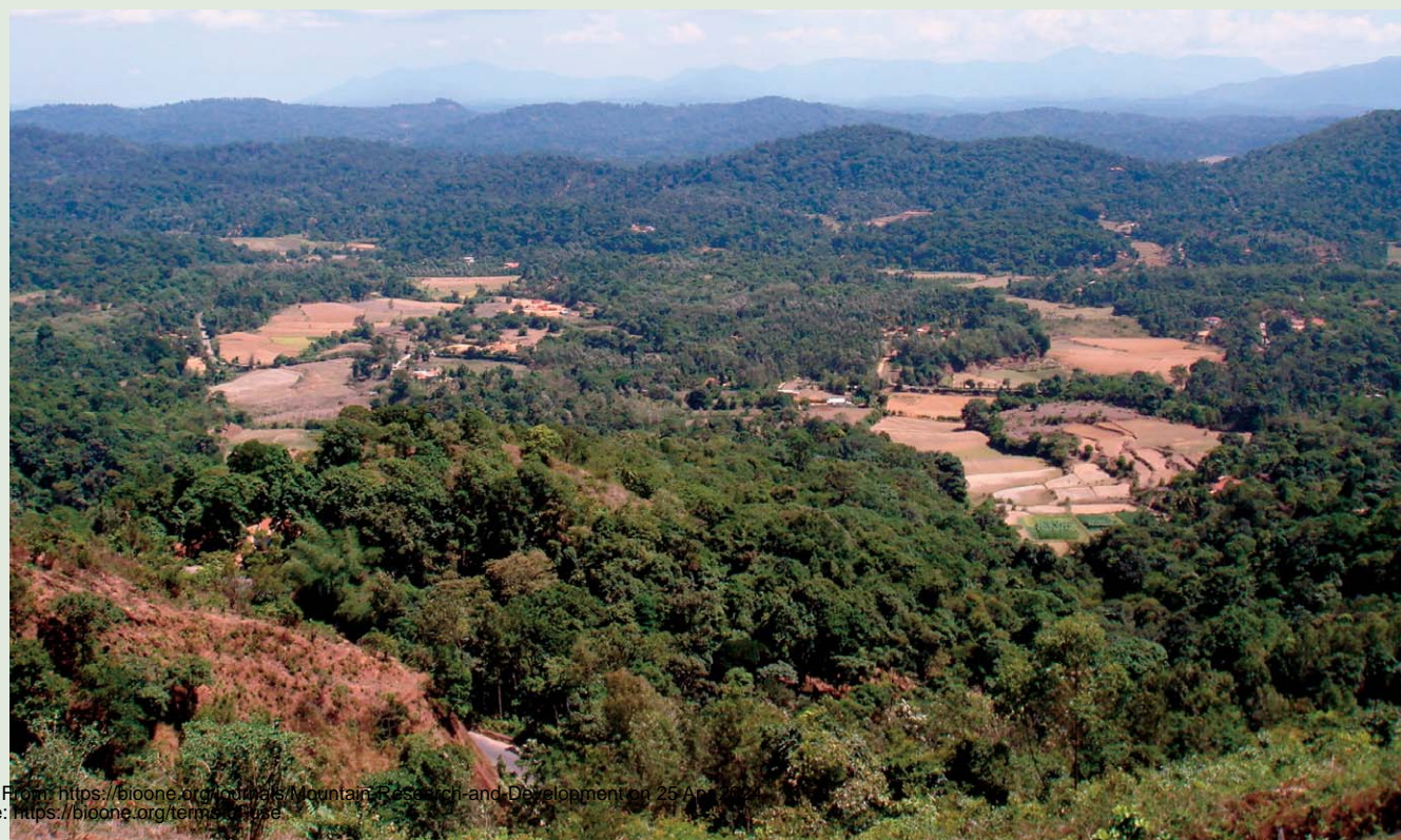
FIGURE 2 Landscape mosaic in Kodagu district: paddy fields occupy the lowlands while coffee plantations and forest fragments are located on the hilltops. A belt of forest reserves and protected areas surrounds the district, as seen on the horizon.

Forest represents almost 50% of the district. Central Kodagu is dominated by agricultural land, essentially coffee estates that cover 30% of the total area of the district. Coffee in Kodagu is grown under tree shade. The other crops associated