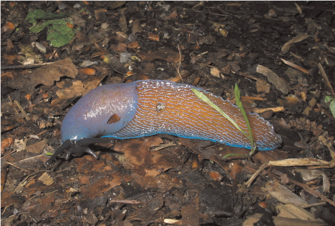
FIGURE 3 The endemic Carpathian blue slug, Bielzia coeruleans .

Carpathians (Kozak et al 2007a); for such studies, access to historic Austro-Hungarian maps is crucial.