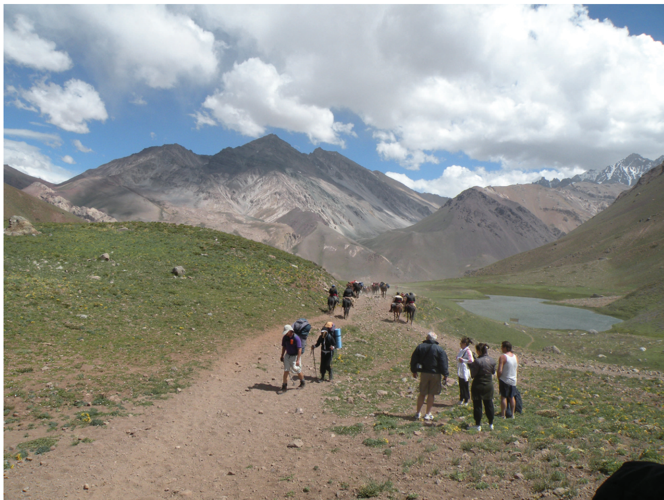
FIGURE 3 Trail use by visitors and pack animals in Horcones Valley, Aconcagua Provincial Park, Mendoza, Argentina.

Reduced propagule pressure at higher elevations, more remote areas of park, or both may also be limiting the spread of non-natives farther into the park, as has been found in other regions (Pauchard and Alaback 2004; Pauchard et al 2009; Speziale and Ezcurra 2011).