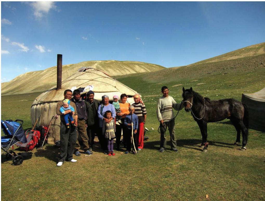
FIGURE 2 A family portrait in the jailoo (summer pasture) in Kyrgyzstan.

stay. Thus, herders have the most immediate impact on livestock and pasture productivity.