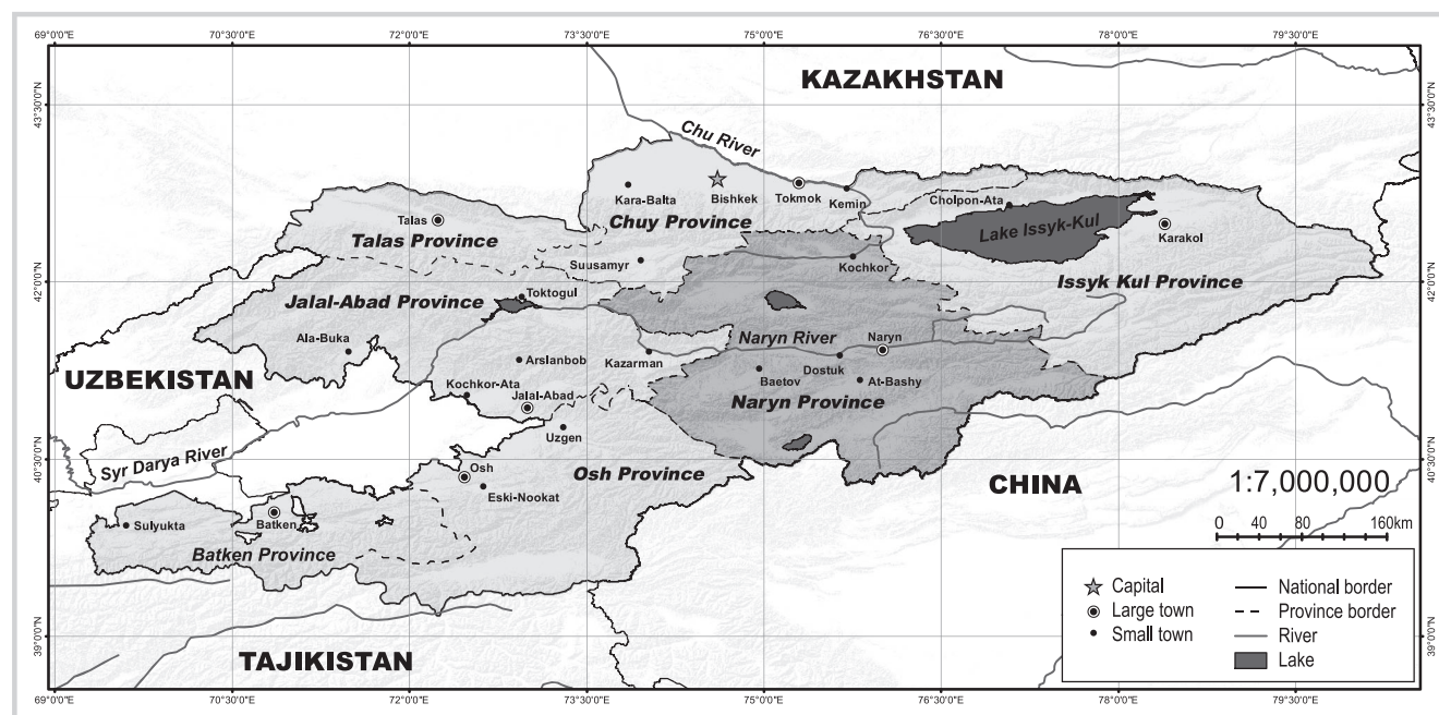
FIGURE 1 Naryn Province in Kyrgyzstan. (Map by Evgenii Shibkov)

Bordering China in the south, Naryn Province also remains part of the Silk Road, because it is situated on a major trade route that connects China with Eurasia and thus links demand and opportunity, for both local and regional trade, particularly in terms of livestock and livestock products.