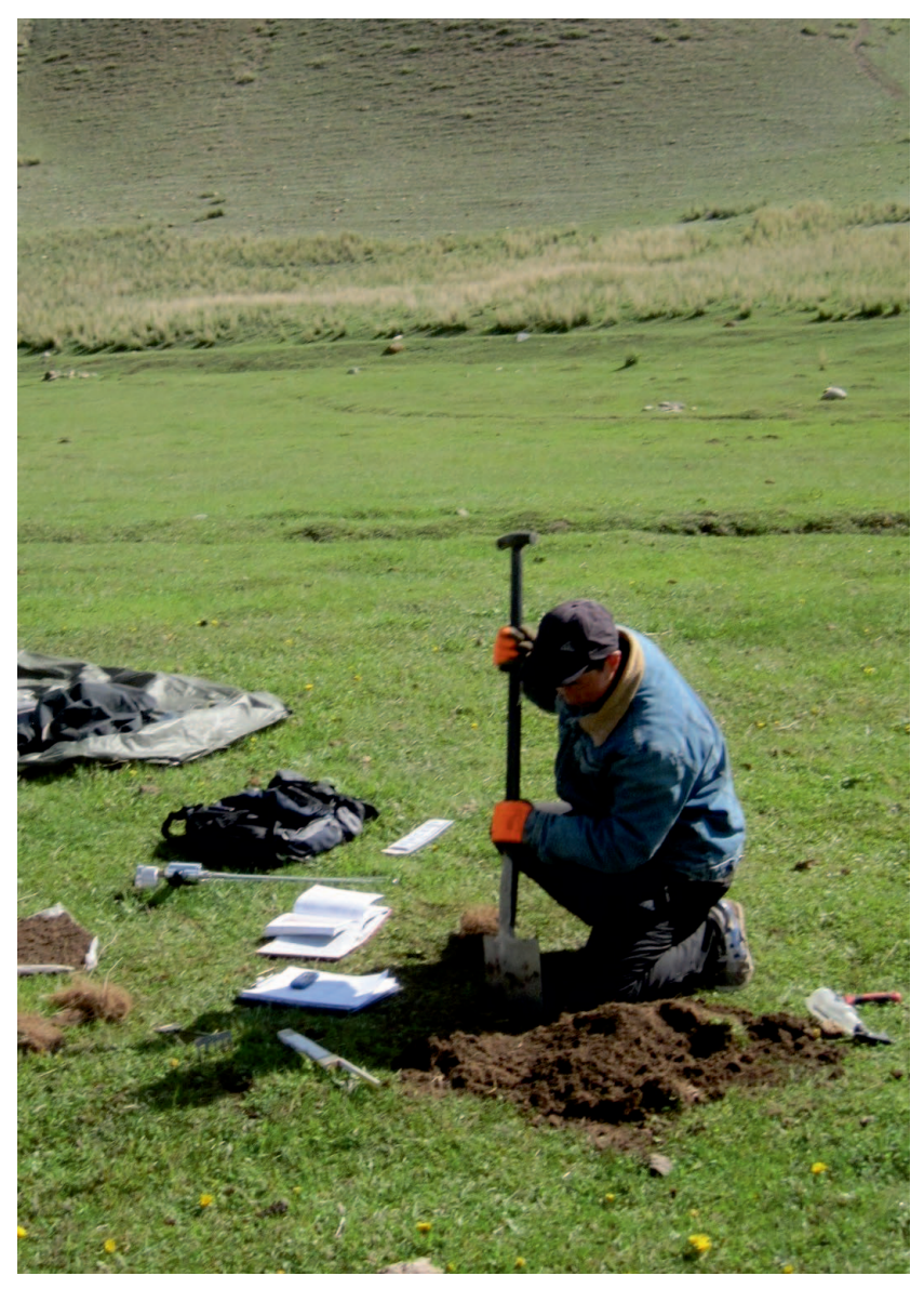
FIGURE 2 Application and verification of the VSA method in the field by Sabir Koshkonbaev (PhD student and colleague), Naryn Oblast, Kyrgyz Republic. (Photo by Peter Kirch, May 2013)

pressure on the winter and spring-autumn pastures. In contrast, the pressure on summer pastures is low.