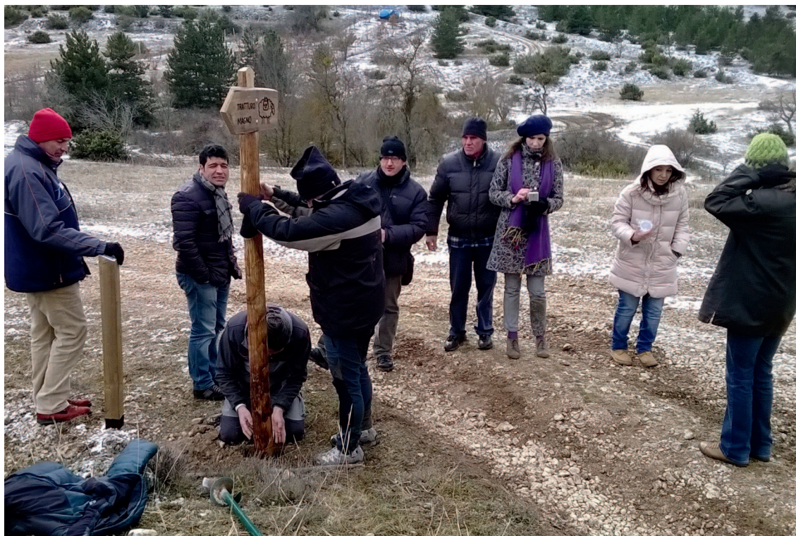
FIGURE 5 Members of a local community group erecting handmade wooden signs outside the mountain village of San Demetrio Ne' Vestini on the Tratturo Magno path. The village mayor is second from left. The shorter post displays a QR code to access information about the site.

Tratturo Magno project outcomes, especially in relation to the need to better manage the restored path and local cultural and natural heritage. These discussions, which were continued in the fourth phase of the SIA Framework for Action, resulted in the creation of a legal entity, the network agreement Landscapes in Transhumance.