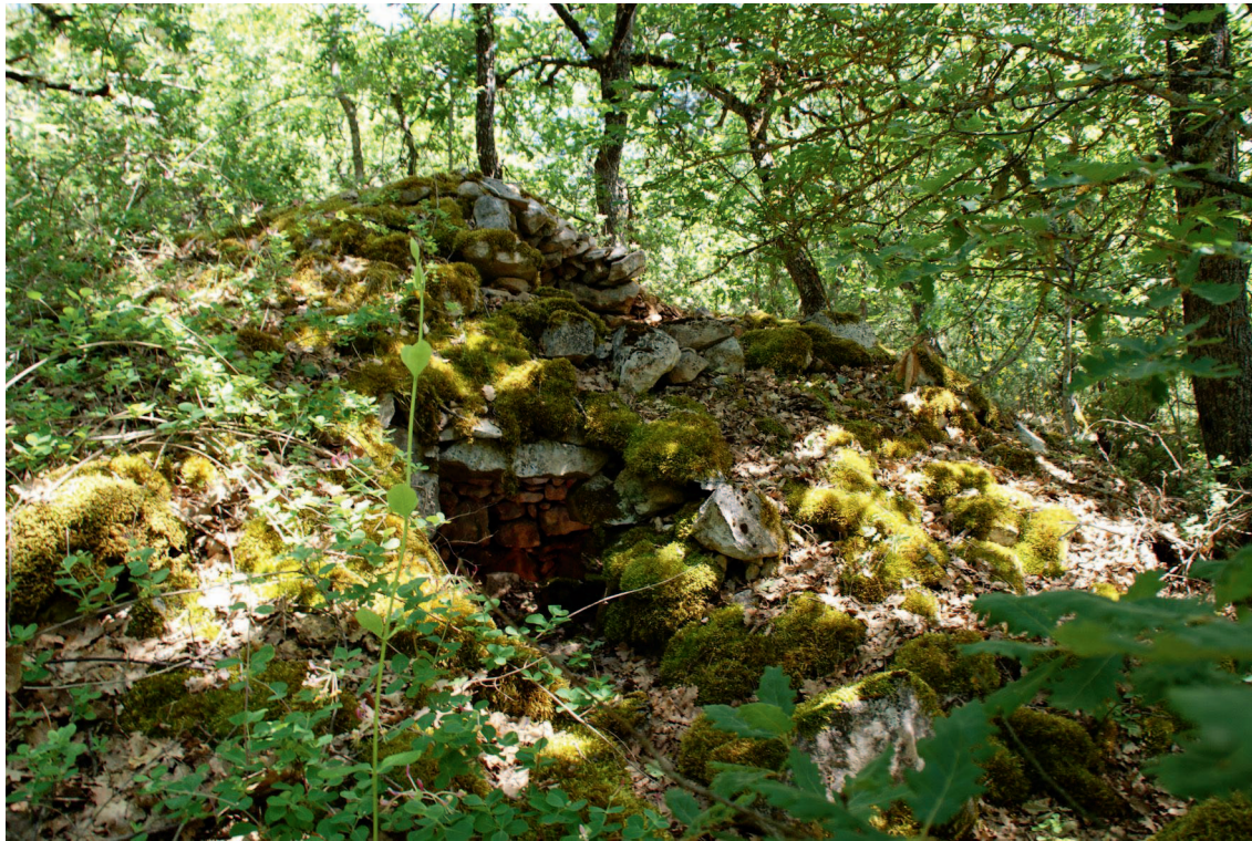
FIGURE 4 An ancient shepherds' refuge.

historic milestone markers along the Tratturo Magno. The landscape analysis also revealed that most cultural heritage along the path was overgrown or in disrepair. A geographic information system was used to georeference any identified heritage resources. This process supported the participatory visualization and community mapping processes during the “engaging” phase, which helped facilitate a shared vision of local cultural and natural heritage resources.