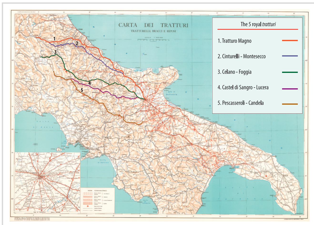
FIGURE 1 The network of tratturi in southern Italy, and location of the 5 royal tratturi . (Map provided by the Regional Office of Tratturi, Foggia, and adapted by the first author)