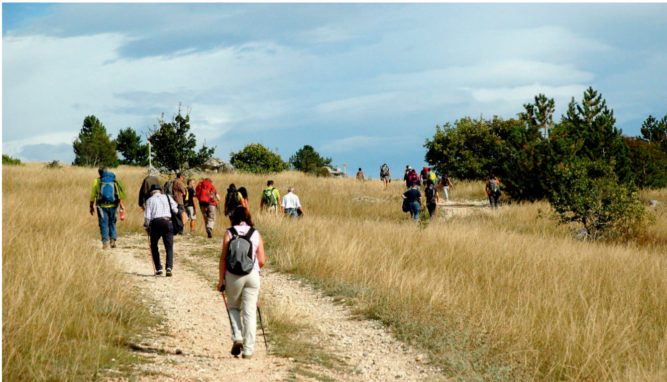
FIGURE 2 Trekkers along the Tratturo Magno.

length. Hereafter, activities related to restoring this section of the Tratturo Magno and the Regio Tratturo Cinturelli-Montesecco are referred to as the Tratturo Magno project. These paths traverse 10 municipalities that were badly affected by the April 2009 L'Aquila earthquake. The lead author of this paper, an Italian social research consultant, was engaged by the Local Action Group Gran Sasso-Velino to support the Tratturo Magno project by gathering tourism data and assisting with community engagement activities.