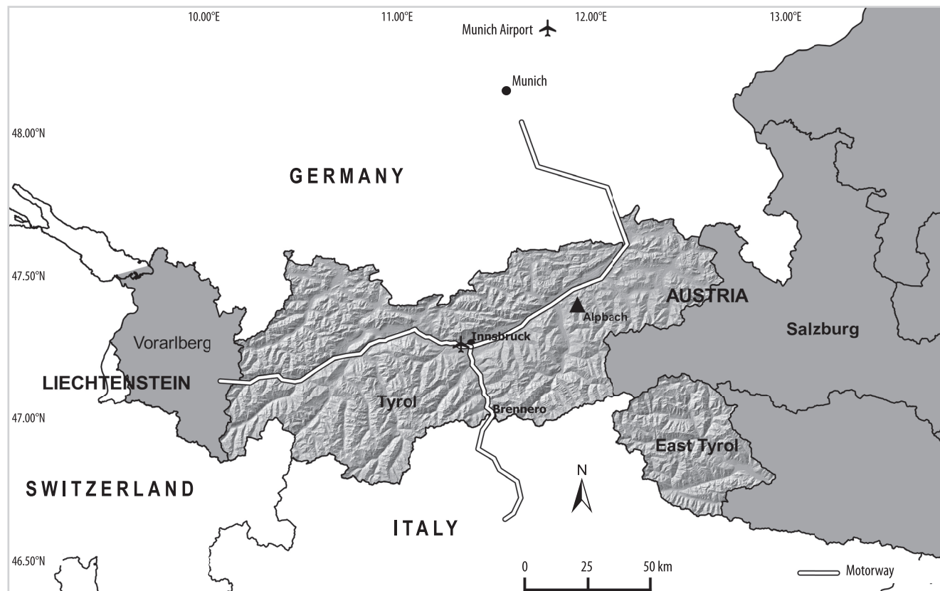
FIGURE 1 Location of Alpbach and the 2 nearest airports, Munich and Innsbruck. (Map by Rainer Unger)

Alpbach, we calculated the total amount of person kilometers traveled (PKT), based on the distances from the visitor hubs to Alpbach, for 4 modes of travel (private vehicle, bus, train, and airplane).