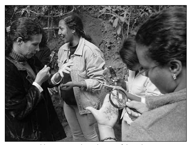
Figure 2. Field activity on the soil types of the Atlantic Forest.

teachers presented the activities they carried out in their schools and the results they obtained, and incorporated the feedback they received into subsequent activities.