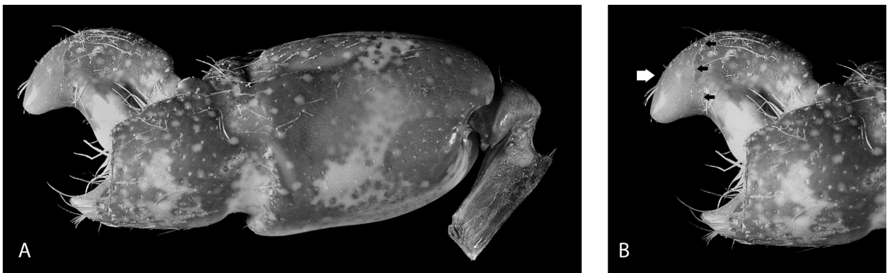
Fig. 3. A – Left major cheliped of an extant Alpheus sp., from the Cortez Sea, Puerto Peñasco (Mexico). B – Close-up of the left major cheliped of the previous extant specimen, showing the strong hardened distal tips of the dactylus (white arrow), with the posterior sinuous margin (black arrows).

FELDMANN et al. 2019). We cannot exclude, however, the possible belonging of the studied strongly calcified claw fingertips to the fossil and extant genus Alpheus , based upon the results reported by HYŽNÝ et al. (2017: table 1) that all samples from the Cenozoic (late Oligocene, Miocene, and Pleistocene) of United States (Alabama), Europe (France, The Netherlands, Austria, Poland, Slovakia, and Czech Republic), Africa (Egypt), and Asia (Japan) have been assigned to Alpheus sensu stricto . Anyway, more detailed analyses of additional material are essential in order to better clarify their real significance, since the areal distribution of these mesofossils is actually undervalued in the Pliocene of Italy (G. PASINI, pers. obs. 2018), based on previous misidentifications or the lack of formal reports.