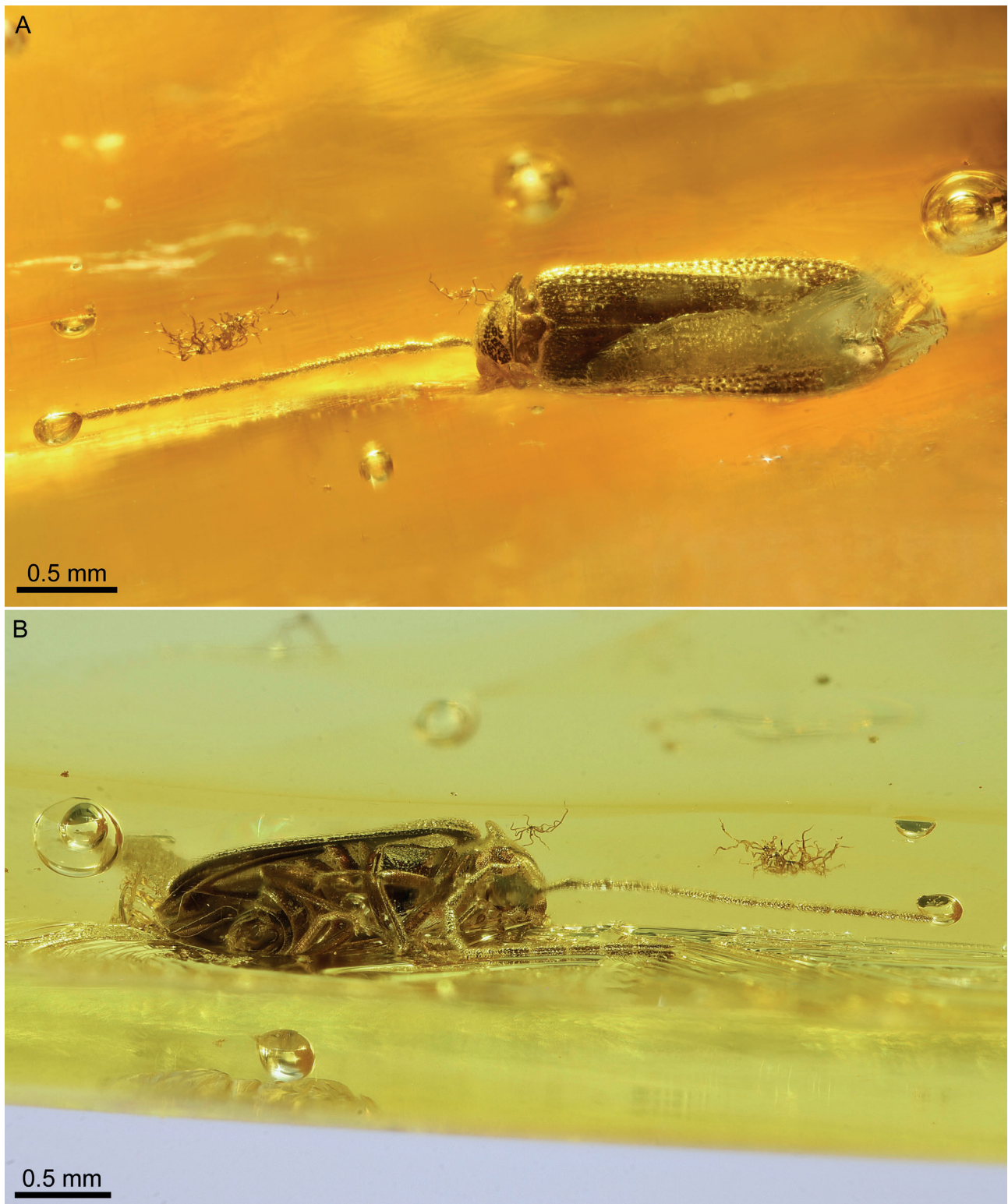
Fig. 1. Maigus sontagae gen. et sp. nov. in Baltic amber (code MAIG 7001). A – Holotype, dorsal view; B – ventral view.