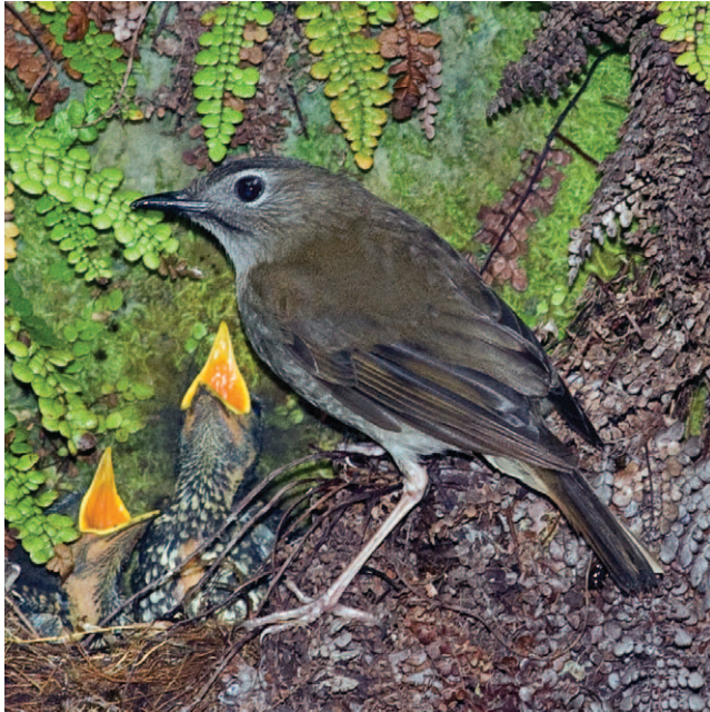
FIGURE 1. Puaiohi at nest with nestlings, Kawaikoi, Kauai, Hawaii, USA.

Mohihi, and Halepaakai (Figure 2). These sites range in elevation from 1,123 m to 1,303 m. The Koaie, Mohihi, and Halepaakai areas support relatively large numbers of Puaiohi, but Kawaikoi is on the edge of the species' range and supports only a few birds (Snetsinger et al. 1999, Woodworth et al. 2009). Wild Puaiohi were banded and studied previously in the Mohihi area from 1995 to 1998 (Snetsinger et al. 2005), and captive-bred Puaiohi were released at Koaie, Kawaikoi, and Halepaakai from 1999 to 2004 (Tweed et al. 2003, Woodworth et al. 2009), but we did not observe any of the previously marked or released birds at these sites during our study.