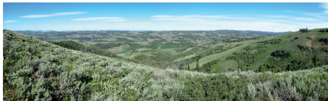
FIGURE 2. Forest patches interspersed within a matrix of sagebrush steppe in the South Hills, Idaho, USA.