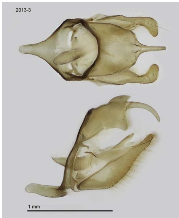
FIG. 3. Euptychia audacia male genitalia in dorsal and lateral views (DJH-2013-3) Acarai Mts./ridge, Sipu R. 2500'-3700'.

uncus, ventral margin concave, prominent projection extending ventrally from posterior margin, subtriangular and somewhat rounded in lateral view, tegumen semi-elliptic in dorsal view; vinculum fused to anterior margin of tegumen; saccus slightly rounded, almost same length as uncus, dorsally thin and evenly broad; valva sparsely hairy, posterior quarter tapered and its apex rounded, long anterior section almost parallelogram shaped, slightly narrowing posteriorly in lateral view, curved inwards at obtuse angle in dorsal view; aedeagus tubular in dorsal view, with straight and broadening anterior portion, in lateral view one third posterior narrower and positioned at approximately 30° angle, slightly broadening anteriorly, slightly longer than length of uncus plus tegumen.