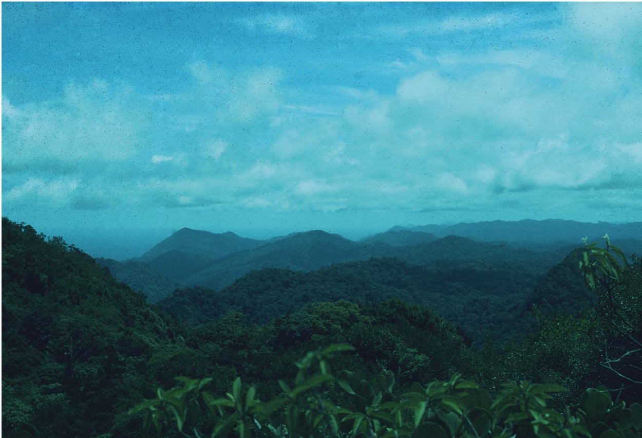
FIG. 5. West Kanuku Mts. from Nappi Peak (approximately 1,000m), Guyana ; over 30 Euptychiina species occur on these and nearby forested slopes and ridges, including E. audacia , E. aquila and probably E. marceli .

are similar in size to E. marceli females and usually larger than E. audacia females, and their most distinguishing character is that they possess two large distal ocelli on the DHW lacking on E. marceli and E. audacia , where the two large ventral ocelli show through the translucent wings. As noted above, E. roraima also manifests a dark brown dorsum, though it is somewhat lighter on the distal third of both the forewing and hindwing; it is equally dark ventrally compared to E. aquila but there are significant wing shape and ventral wing pattern differences between E. roraima and E. aquila elucidated in the original description of E. roraima . The male genitalia of E. aquila differ from the genitalia of E. marceli by having a slightly curved and narrower uncus; a conspicuous postero-ventral wedge-shaped projection of the tegumen; a rather triangular distal half of the valvae; an anteriorly curved aedeagus. The male genitalia of E. aquila differ from the genitalia of E. audacia by the conspicuous postero-ventral wedge-shaped projection of the tegumen being narrower and longer in E. aquila . The female genitalia of E. aquila are distinguished from