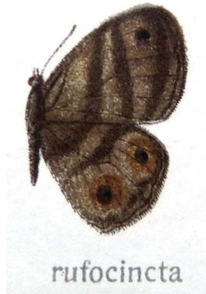
Fig. 8. Euptychia picea female form rufocincta illustration from Weymer (1911).

possible close relationship of E. aquila and E. roraima .