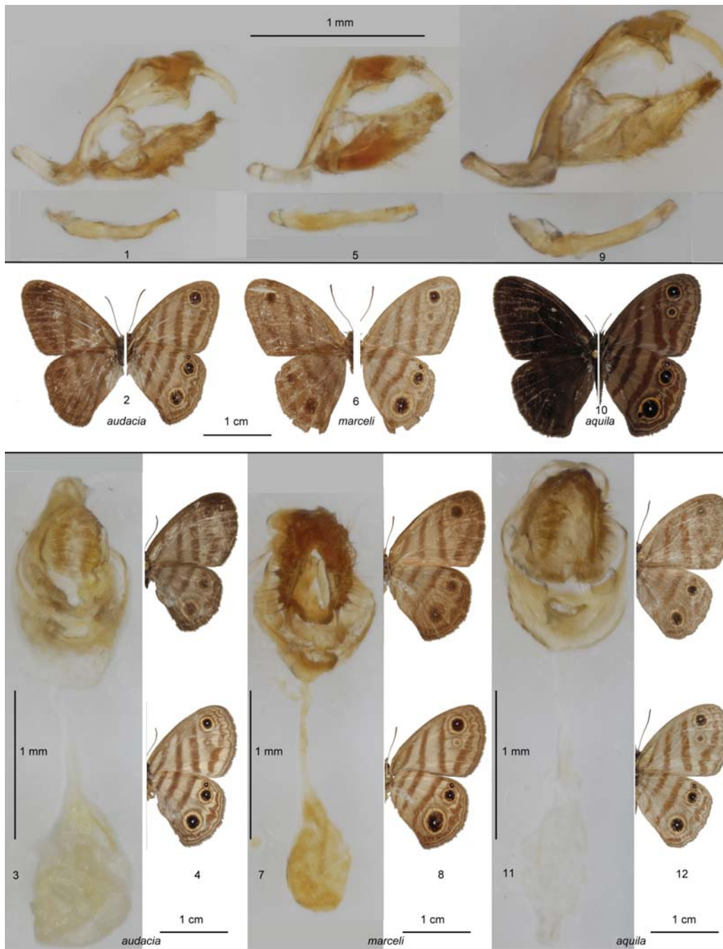
FIG. 2. Male and female genitalia of E. audacia , E. aquila , and E. marceli , with dissected specimens.

1-4 : Euptychia audacia . 1, 2 : male ; 1 : genitalia (PAG 276) of specimen 2, PK27 route de Kaw, Roura, French Guiana, 24-VIII-1993, n° 540, collection L. & C. Brévignon. 3, 4 : female ; 3 : genitalia (PAG 1105) of specimen 4, Massif du Mitaraka, Borne 1, 2°13'N 54°26'30"W, 23-IX-2006, French Guiana, J.-P. Champenois leg. n° 22660 PAG 1105. 5-8 : Euptychia marceli . 5, 6 : male ; 5 : genitalia (PAG 277) of specimen 6, Galion, Roura, French Guiana, 1-V-1990, n° 559, collection L. & C. Brévignon. 7, 8 : female ; 7 : genitalia (PAG 1104) of specimen 8, Saint-Georges-de-l'Oyapock, French Guiana, 30-V-1985, n°563, collection L. & C. Brévignon. 9-12 : Euptychia aquila . 9, 10 : male ; 9 : genitalia (PAG 1005) of specimen 10, Massif du Mitaraka, Borne 1, 2°13'N 54°26'30"W, 27.IX.2006, French Guiana, J.-P. Champenois leg. n° 22653, collection B. Hermier. 11, 12 : female ; 11 : genitalia (PAG 1107) of specimen 12, Massif du Mitaraka, Borne 1, 2°13'N 54°26'30"W, 29.IX.2006, French Guiana, J.-P. Champenois leg. n° 22663, collection B. Hermier.