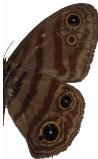
FIG. 7. Euptychia aquila male from the Tumuc-Humac Mts., French Guiana, the only known E. aquila specimen manifesting a satellite ocellus below the large VHW ocellus. This is a good example of the type of individual variation seen in Euptychia ventral ocelli patterns even among taxa like E. aquila , where this pattern is uniform to a large degree.

Both E. audacia and E. aquila are described in this genus due to their morphological resemblance to E. marceli and some other Euptychia . The placement of these new species in the genus Euptychia is reinforced by the presence of a projection of the tegumen above the uncus; as mentioned above, this character is thought to be a possible diagnostic character that differentiates this genus from other genera in this subtribe (Freitas et al. 2012). Whether this genitalic structure is a unique trait for Euptychia will be ascertained when all Euptychiina , including many undescribed taxa, are dissected. It is worth noting that this structure varies widely among known Euptychia , as