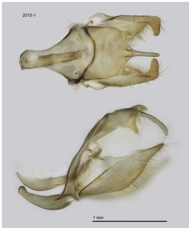
FIG. 6. Euptychia aquila male genitalia in dorsal and lateral views (DJH-2013-1) Two Hat Mt, E. Kanukus, S. Rupununi, S. Slope Summit 2300-2600'.