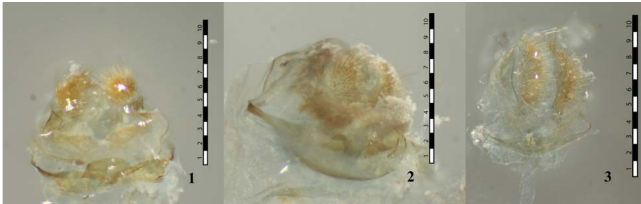
FIG. 4. Ventral view of lamella antevaginalis: 1. Euptychia audacia (SN-14-81) Relais de Patawalodge, Kaw Mountains, Cayenne, French Guiana (FLMNH voucher 191766); 2. Euptychia aquila (SN-15-23) Acarai Mts./ridge, Sipu River (USNM ENT 00233743); 3. Euptychia marceli (SN-14-79) 85km. S El Dorado (nr Las Claritas Hotel), Bolívar, Venezuela (FLMNH voucher 191015).

Brazil contiguous with French Guiana, in the mountains of Roraima state, Brazil adjacent to Guyana's easternmost Acarai Mts., and possibly in the tepui region of Roraima state. It could also occur in the lowlands of Amapá, Brazil which are contiguous with the French Guiana lowlands, in the lowlands of Pará, and possibly in the lowlands of Amazonas state, Brazil adjoining Pará and Roraima states.