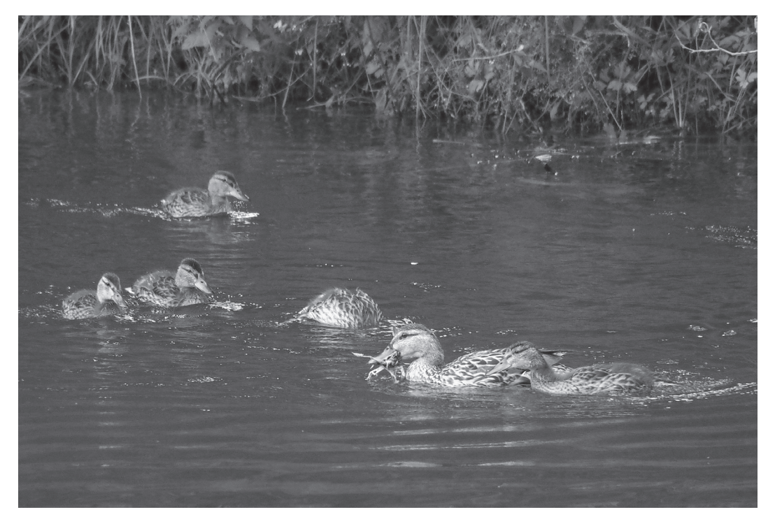
Figure 1. Adult Mallard defending and consuming a Grey Wagtail.

They were vigorously shaking the riparian and scrub vegetation on the bank. Following this activity, the adult Mallard was observed repeatedly shaking its head laterally and compressing a passerine bird in its bill. The bird was identified from pictures and recording video as a Grey Wagtail fledgling with almost complete plumage (Fig. 1). The adult Mallard was repeatedly mobbed by the vocalizing subadults trying to remove parts of the bird carcass, but the adult defended it. The adult Mallard had obvious difficulties with swallowing the whole bird, partly due to the extended wings of the Grey Wagtail. The female Mallard repeatedly submerged the carcass, repositioned it in its bill and tilted its head backward, a process lasting over 10 min until the Grey Wagtail was eventually entirely consumed. During this time, a second bird was flushed from the bankside vegetation by the activity of the subadults shaking the long undergrowth, and landed on the water surface, some 30 m from the bank and 12 m away from the Mallard group. The bird, identified from pictures as a fledgling Black Redstart (Fig. 2), opened its wings