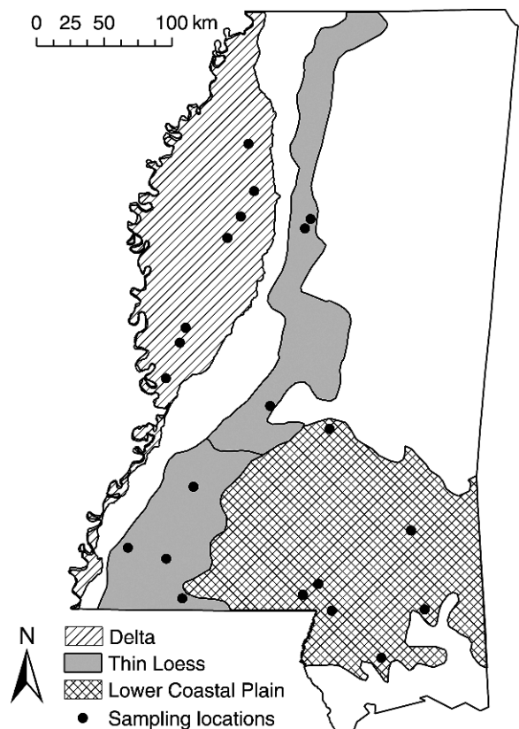
Figure 1. Locations of properties sampled for soils and deer forages during spring and summer 2008 in Mississippi, USA.

We sampled from properties in three soil resource areas in Mississippi, USA (Pettry 1977; Fig. 1). Soils of the Delta resource area are typically alluvial soils created from flooding of the Mississippi River and its tributaries; land use is primarily row-crop agriculture. The Thin Loess resource area comprises soils developed from windblown material, generally \leq 1.3 m thick, which becomes progressively thinner as it merges with soils of the Upper and Lower Coastal Plains. The silty soils are highly susceptible to erosion, and the loess material is often eroded to expose the underlying loamy materials. Soils in the