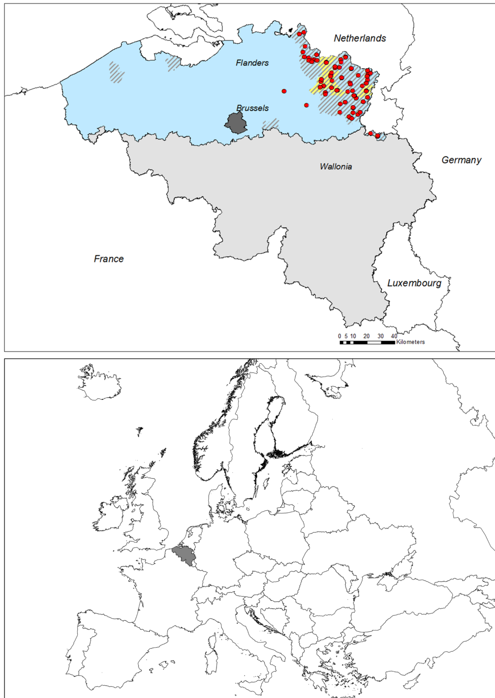
Figure 1. Dashed areas: distribution area of wild boar in Flanders (northern Belgium) in 2017. Yellow: distribution area in 2007 at start of recolonisation. As the exact location of DNA-samples are unknown, the red dots represent the centroid coordinates of the municipality within the specific game management unit of each sample.

detect a potential structure (Jombart et al. 2010). Tests were performed for each identified genetic cluster. HWE was tested using the adegenet R package, LD was tested using the genetics R package (ver. 1.3.8.1, Warnes et al. 2015) and results were corrected for multiple testing using the Bonferroni correction.