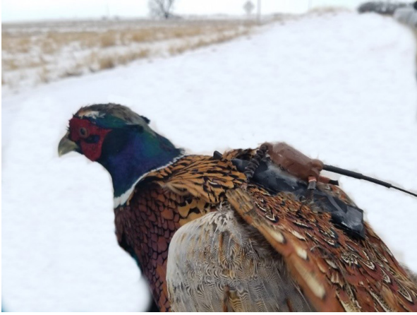
Figure 2. Self-made, low-cost GPS tracker weighing 43 g (<5% of body mass) attached to a male ring-necked pheasant in Beadle County, South Dakota, 2019.

captured wild male and female pheasants using cylindrical walk-in traps (12' × 3') with two funnel entrances (8" × 8") baited with corn Zea mays from January to March 2019. Pheasants were weighed to verify that trackers were within ≤5% of body mass (IACUC 16-086A) and were monitored four days per week. GPS trackers were retrieved upon detection of the activated mortality switch on the VHF transmitter.