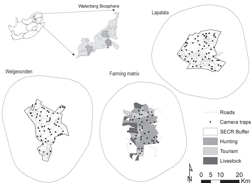
Figure 1. Location of the study sites within the Waterberg Biosphere, South Africa and camera locations within each study site as well as the buffer used in the spatially explicit mark recapture models. Shaded areas in the farming matrix indicated the different land use types.

We followed camera trapping protocols for closed population mark recapture studies on large carnivores (Karanth and Nichols 2002). Camera traps were set out in pairs in a grid with a cell size of 6.25 km 2 , which corresponds to approximately half the smallest home range diameter for leopards in mountainous areas (10 km 2 ; Smith 1978). This resulted