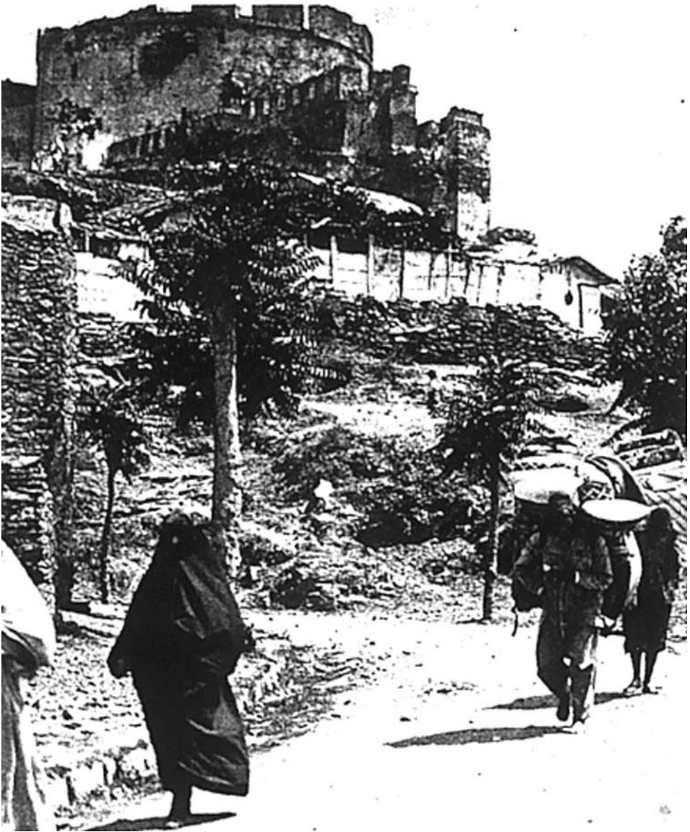
Fig. 5. The NE side of the Walls in 1913, when Ailanthus altissima was planted for ornament.

(sub-)Balkan element is represented only by 12 taxa, 5 of them occurring on the Walls, i.e. Sedum urvillei , Thymus sibthorpii , Verbascum leucophyllum , V. undulatum and Silene flavescens subsp. thessalonica . The last taxon, originally described as S. thessalonica Boiss. & Heldr. because of the proximity of its locus classicus to the city (“In rupibus montis Korthiati pr. Thessalonicam alt. 1500’ leg. Heldreich), is mainly found in NE Greece and extends to F.Y.R. Makedonija and Bulgaria just beyond the Greek borders (Greuter 1997).