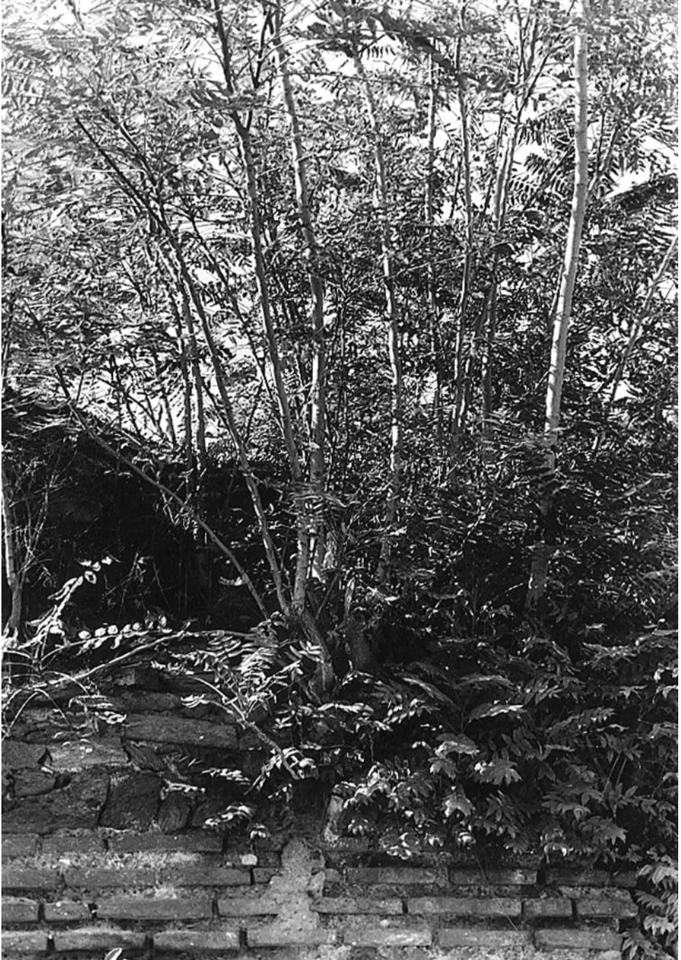
Fig. 4. Ailanthus altissima grows abundantly on the Byzantine Walls of Thessaloniki.