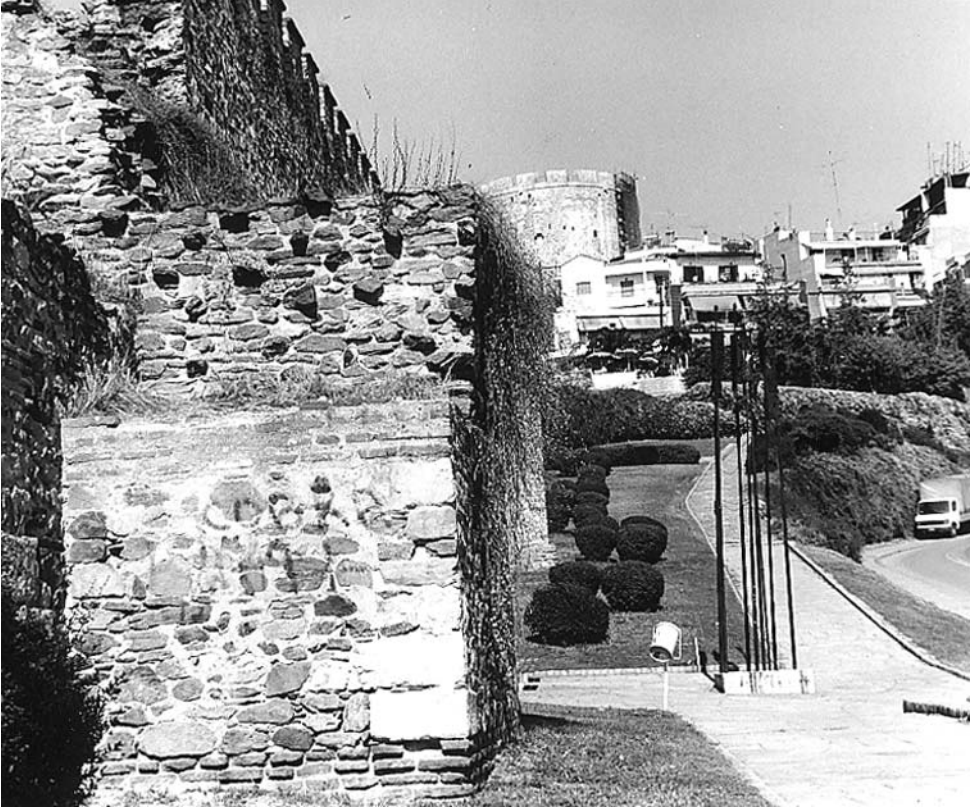
Fig. 2. The E part of the Byzantine Walls of Thessaloniki with Capparis spinosa subsp. spinosa growing on the side of the wall.

part. The greater intact part stands above Ag. Dimitriou Street. The height reaches up to 12 m, and the width ranges between 1.0 and 2.8 m. The style of the masonry varies according to the periods at which the different restorations were carried out. The greater part of the Walls, dating from the early Christian and the Byzantine periods, is constructed either of blocks of greenschist with interposed brick bands or of bricks decorated with rubble (Gounaris 1982). Mortar is mainly composed of lime and silicic materials in proportion of 1: 0.5-1: 2 (Papayanni pers. comm.). The Walls are surrounded by narrow open areas, up to 17 m from each side, which are either planted with a few species of ornamental trees and shrubs or are covered with spontaneous vegetation (Fig. 1-2).