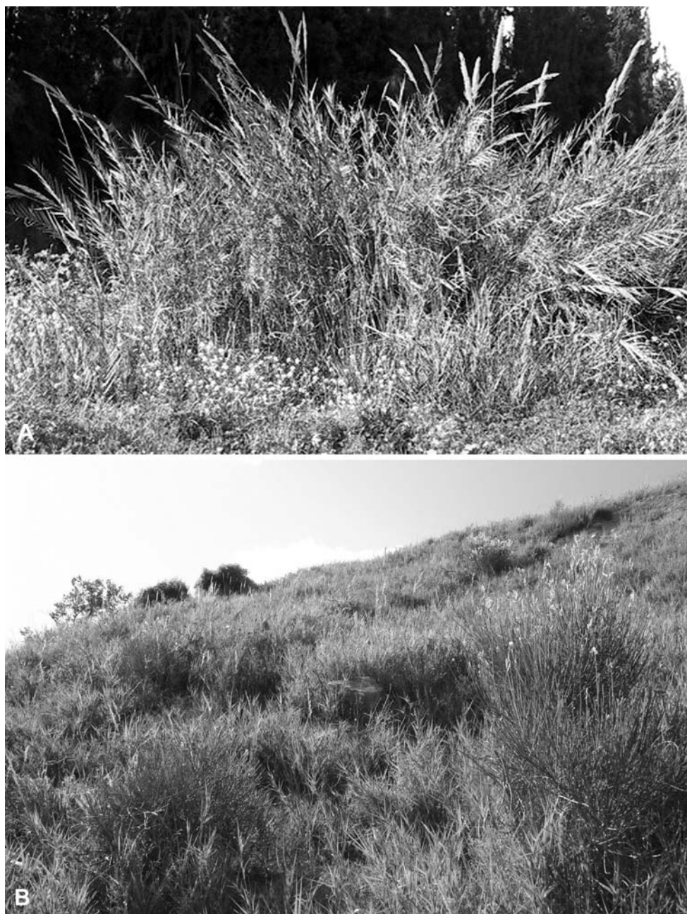
Fig. 2. A: Arundo mediterranea , isolated tufts of “bunch-reed” with obliquely erect peripheral culms at the type locality in Israel. – B: A. collina forming a monospecific grassland, with a few Spartium junceum shrubs, on clay slopes at the catchment area of Biferno river, S Italy.