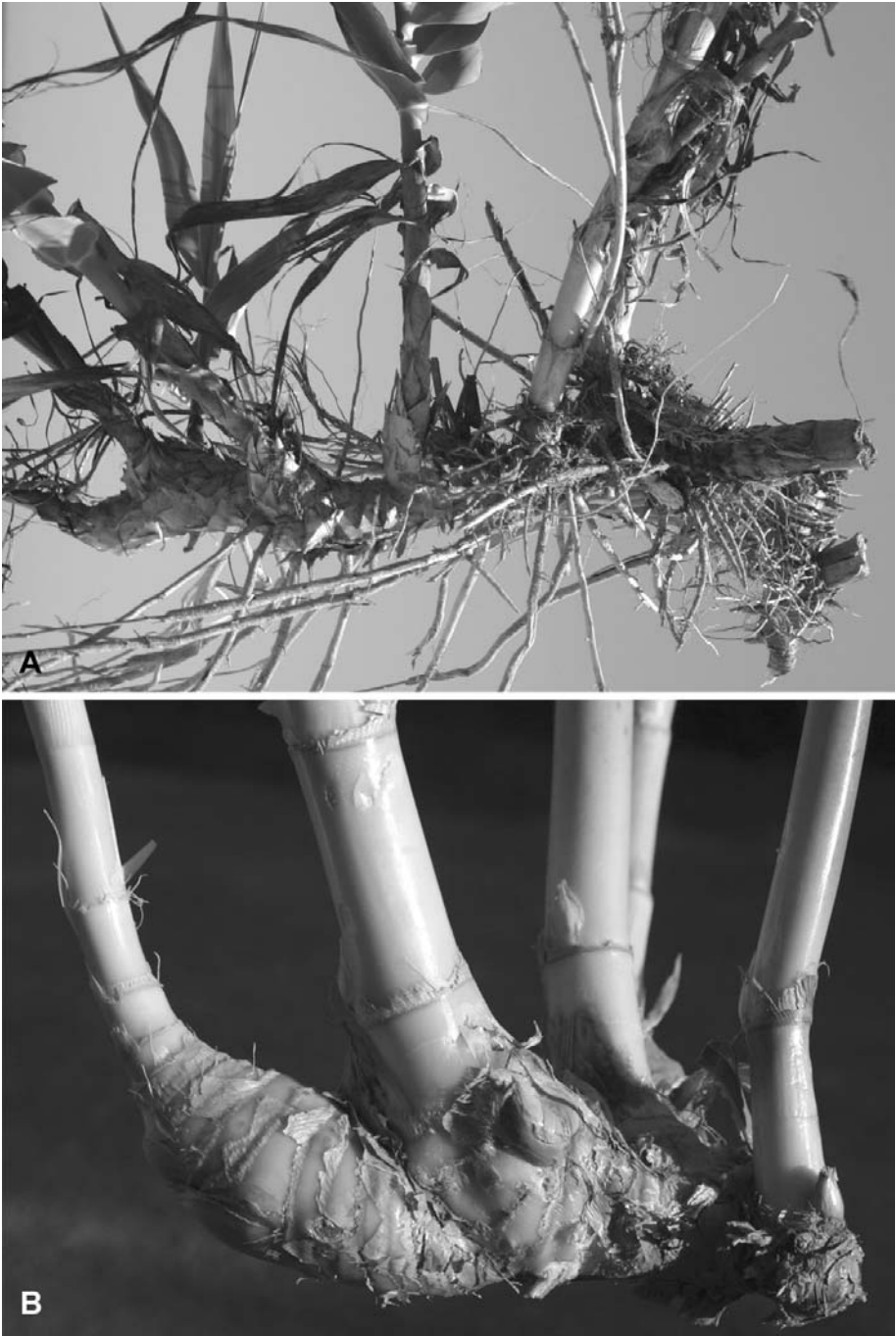
Fig. 3. A: Arundo donax rhizome with spaced orthotropic culms. – B: A. mediterranea , each culm has a 8-10 cm long pachyrhizome section, rich in buds, which may function as a corm; each of the three left culms emerged obliquely from the base of the older culm.