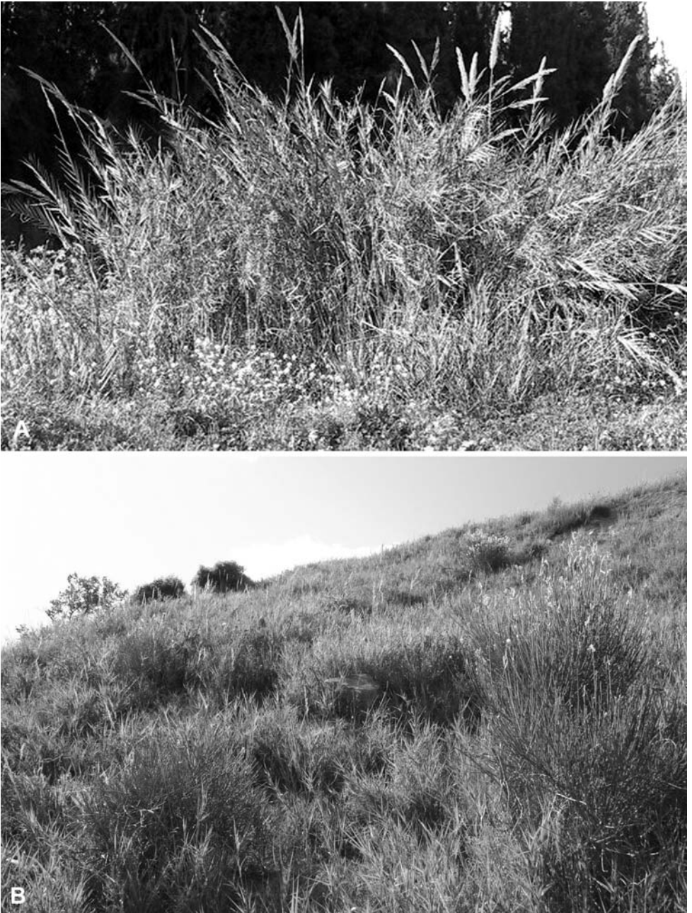
Fig. 2. A: Arundo mediterranea , isolated tufts of “bunch-reed” with obliquely erect peripheral culms at the type locality in Israel. – B: A. collina forming a monospecific grassland, with a few Spartium junceum shrubs, on clay slopes at the catchment area of Biferno river, S Italy.