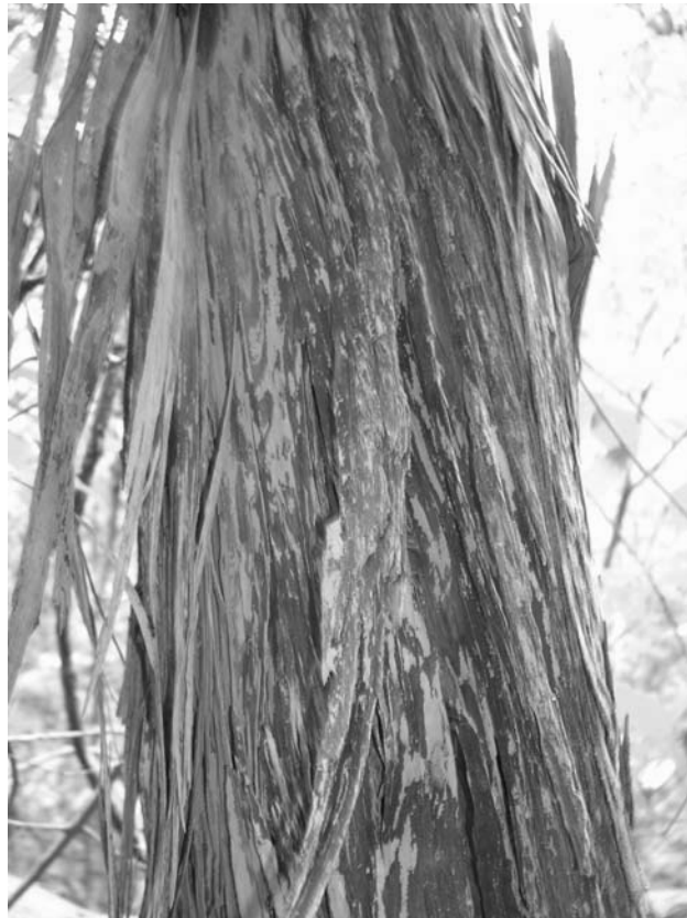
Fig. 2. Trunk of Tetrazygia decorticans , with bark peeling off in laminar shreds.

species is very rare. It occurs from 600-650 m in seasonally wet evergreen forest. Associated melastome species include: Miconia prasina (Sw.) DC., Meriania leucantha subsp. nana (Triana) Borhidi, Tetrazygia bicolor (Mill.) Cogn. and Clidemia barbeyana Cogn. Other associated species include Calyptronoma plumeriana (Mart.) Lourteig, Cyathea arborea (L.) Sm., Alsophila cubensis (Underw. ex Maxon) Caluff & Shelton, Cinnamomum montanum (Sw.) J. Presl, Ocotea leucoxylon (Sw.) Mez, Guarea guidonea (L.) Sleumer, Talipariti elatum (Sw.) Frixell, Roystonea regia (Kunth) O. F. Cook, Dendropanax arboreus (L.) Decne. & Planch., Faramea occidentalis (L.) A. Rich., Wallenia laurifolia (Jacq.) Sw., Citharexylon caudatum L., Casearia sylvestris Sw. subsp. sylvestris and Tabernaemontana ambliocarpa Urb.