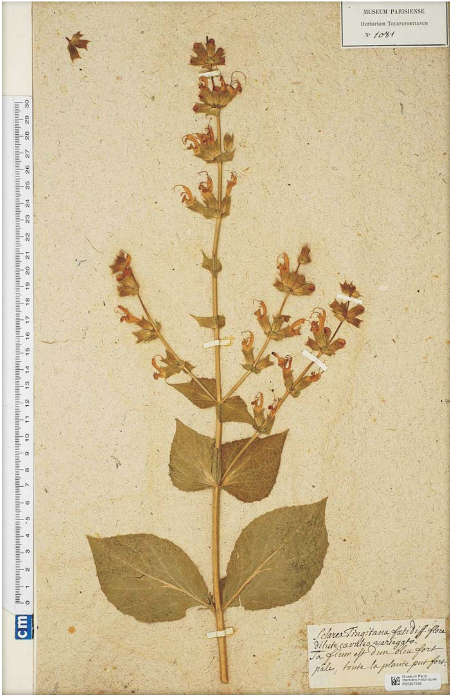
Fig. 3. Tournefort's specimen (at P), the designated lectotype of Salvia tingitana .