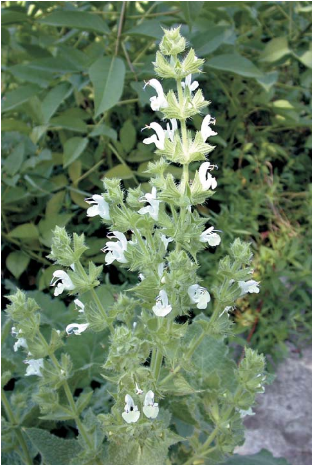
Fig. 5. Inflorescence of a cultivated plant of Salvia tingitana .