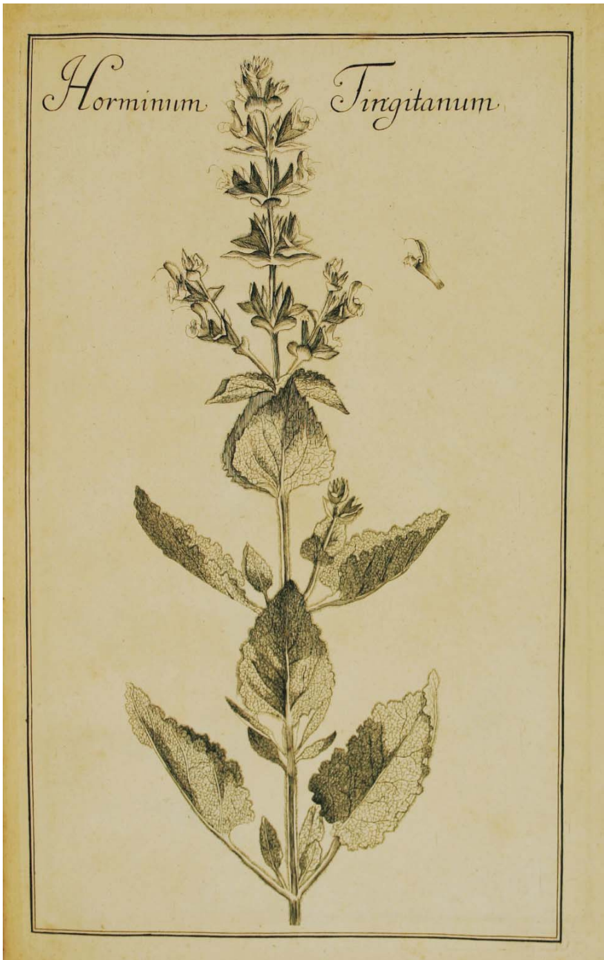
Fig. 2. The exclusive plate of “Horminum tingitanum” (Rivinus 1690: t. 62) in a copy held at the Universitätsbibliothek Erlangen-Nürnberg; to this plate Etlinger (1777) referred in the original description of Salvia tingitana .