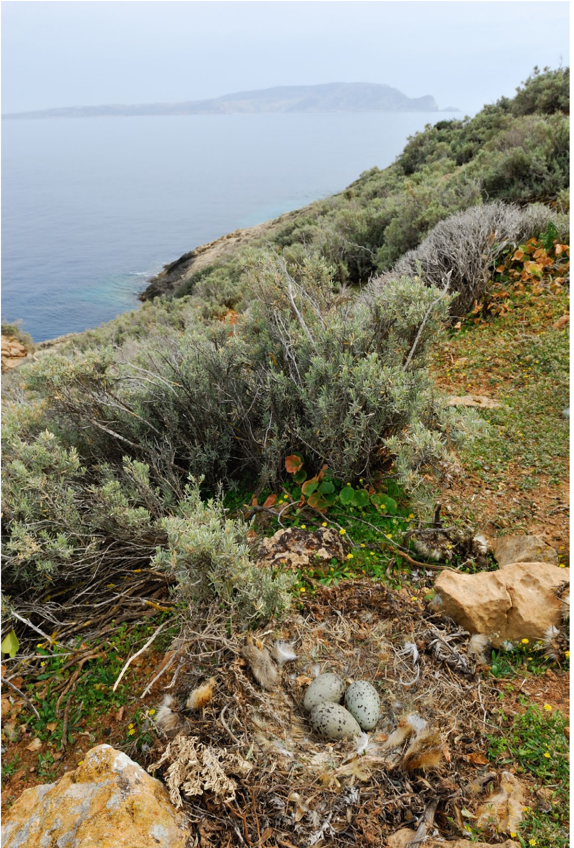
Fig. 3. Halo-nitrophytic scrub with Atriplex mollis on Gavdopoula in its single European locality, with gull's nest ( Larus michahellis michahellis ). – Photo by N. Turland, April 2009.