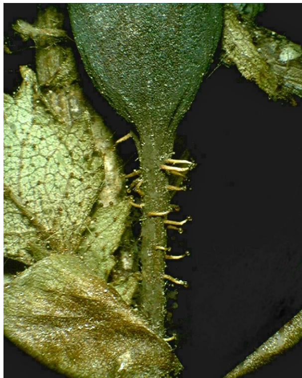
Fig. 3. Rosa micrantha subsp. chionistrae – lower part of the hypanthium with a rather long, glandular-setose pedicel; at the left side the lower surface of a leaflet with glands ( Hand 5070).

The following remarks are based on field studies (supported by C. S. Christodoulou) and the material cited below. Some characters not present in herbarium specimens were noted in the field. The first author analysed the characters of these samples and compared it with the detailed description of Rosa chionistrae by Meikle (1977), the protologue of Lindberg (1942) and with high resolution photos of the syntypes in the herbarium of the University of Helsinki (H). We supplement in the following, in